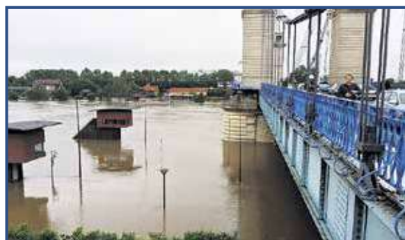
An Update from Elim Paris - Pg 4