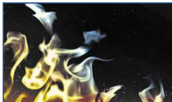
The Baptism of the Holy Spirit - Pg 17