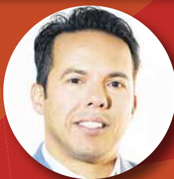
Rev Dr Samuel Rodriguez USA