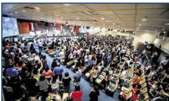
Trinity@Adam - Combined Closing service - Pg 10 & 11