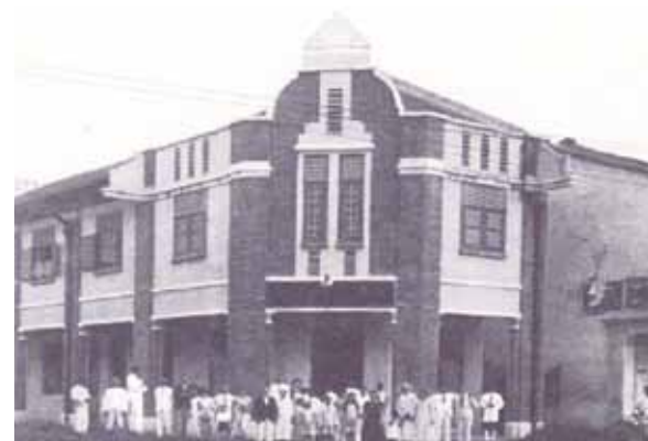
The chapel at 486 Serangoon Rd