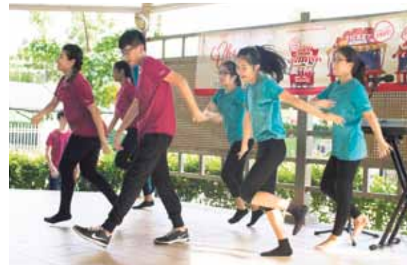
A dance item by our Youth Ministry