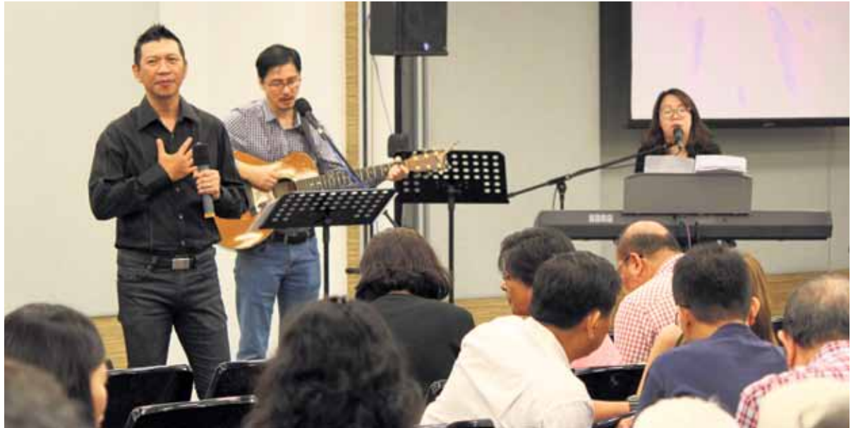
Sharing of the Word

God requires us to take responsibility for the expansion. We can hear great messages and talk about faith all day but until we step out in faith, nothing will happen. We will never see the miracles of God. The same applies for the company of prophets. When the prophets realized that they needed a breakthrough and expansion, notice that they said "each of us" and then collectively "let us",