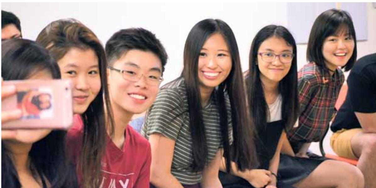
Coming together to celebrate Jesus