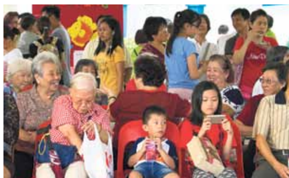
Calvary's Christmas Carnival with Bedok North residents

For Christmas this year, Calvary Assembly exemplified love in action in the heartlands through a Christmas carnival in Bedok North.