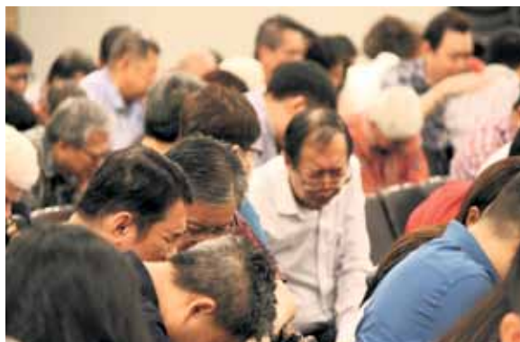
Seeking the Lord together