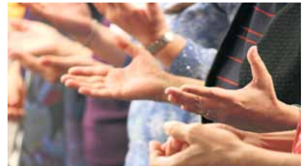
Lifting of hands and hearts

As we move forward in 2017, let us allow God to bring healing to our past pains, refresh our perspectives and theology, and empower us to become the