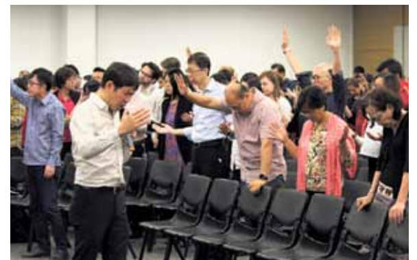
Praying in unison