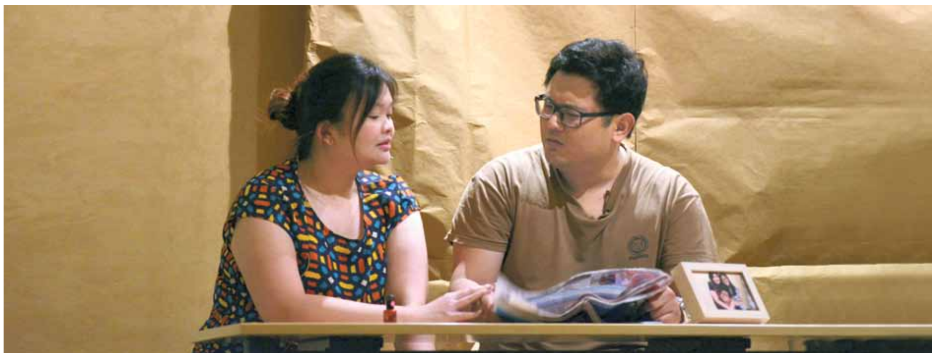
Our cast deep into their roles