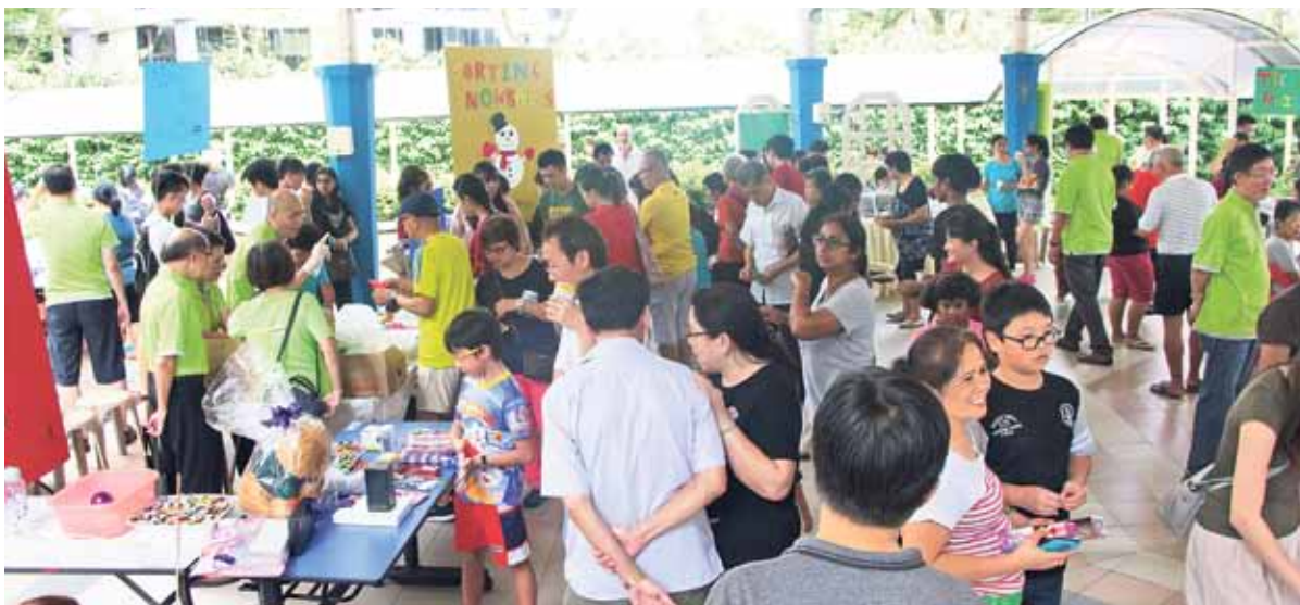
Calvary's Christmas Carnival with Bedok North residents

Then, the residents began streaming in and the pavilion came alive with clusters of people going round to the different carnival stalls. The lively atmosphere was a draw to many passers-by. The children were delighted by the cotton candy and popcorn stands that were specially brought in for the event.