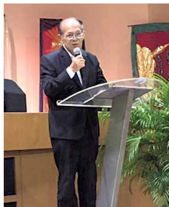
Preaching in Malacca one month after recovery