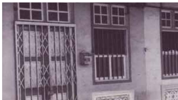
The church at 531 Serangoon Rd