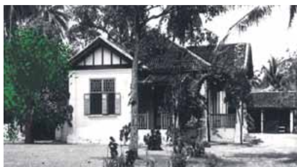
The old Elim Church at 1079 Serangoon Rd