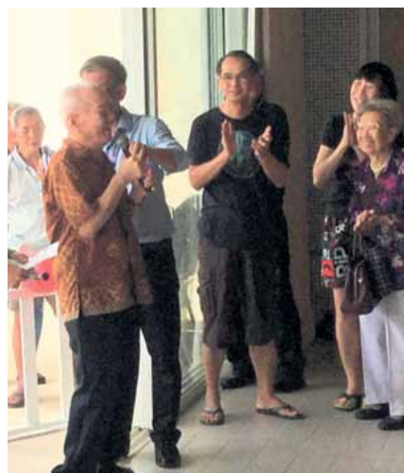
Father-in-law giving testimony during his water baptism

Because of all these miracles, my father-in-law, formerly from another faith, has received Christ. He was baptized last Christmas. We praise God for this, because we know that all things have worked together for good to those who love Him.