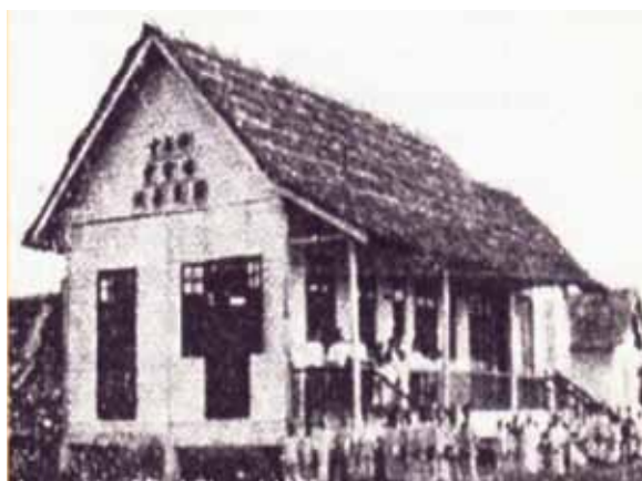
The chapel in 1928