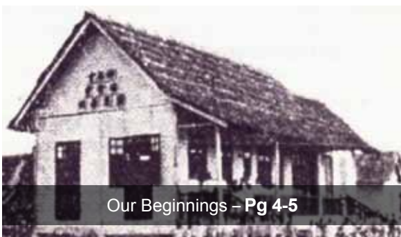
Our Beginnings – Pg 4-5