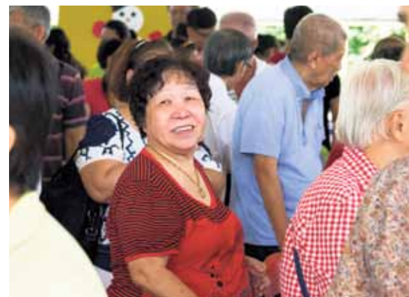
Their smiles brightened our day