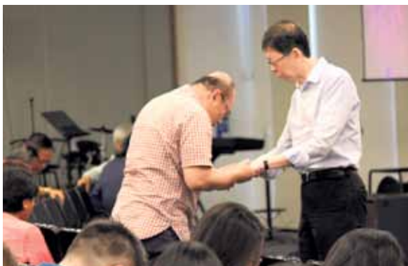
Supporting in prayer

minister He has destined us to be. "See, I am doing a new thing! Do not dwell on the past" (Isaiah 43:18-19) Let us not bring the pain of 2016 to 2017 and let what has happened in 2016 recur in 2017 because it's a brand new year, a brand new season and a prophetic season of God for our lives. Let us allow God to redefine our pain and past so that He calibrates it for the future, knowing that our destiny is not behind us but in front of us. Our destiny is not found in history but it's in our future!