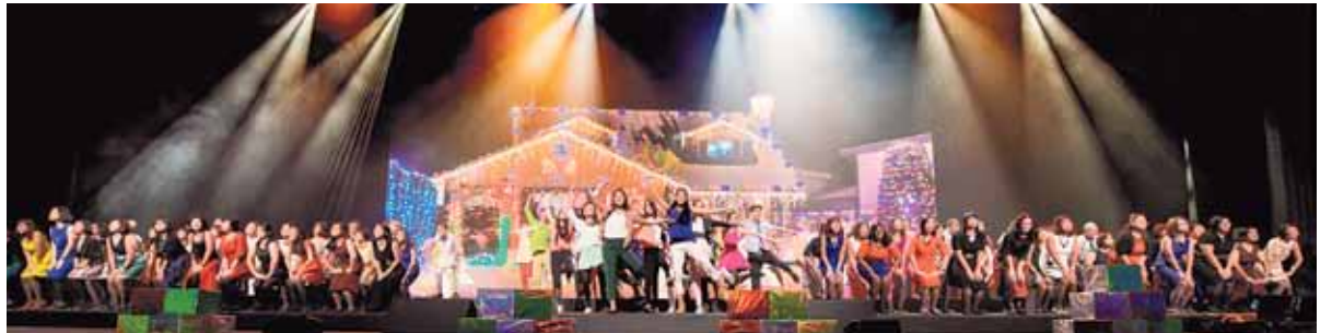
A dazzling performance by the dancers

Staged at the opening of a new shopping mall, three radio DJs went on air to ask one very important