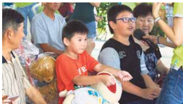
Fun, food and games!