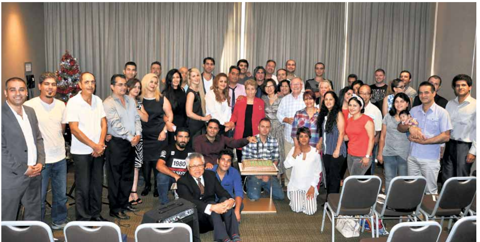
Gathering after service