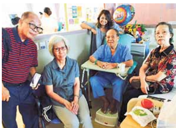
Among my family during hospitalization

In the ward, my bed was like a counselling station! I met a hawker in the same ward. He shared his problems with me and I'd the privilege to lead him to the Lord. I also had an opportunity to pray with a young man of another faith. God led me to pray with some of the nurses. For those few days I functioned as a Pastoral Counsellor. I forgot I was a patient! A pastor suffering affliction needn't feel ashamed.