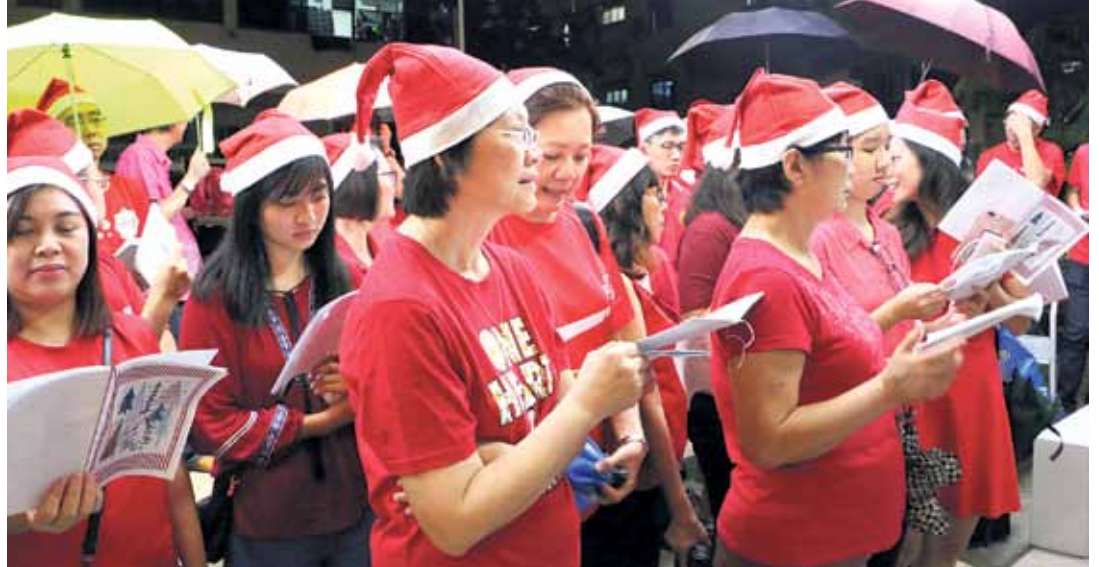
Singing carols along Lorong 8 Geylang