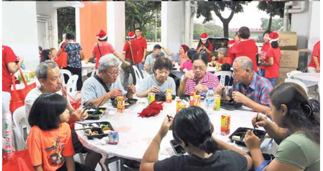
Ministering at Upper Boon Keng