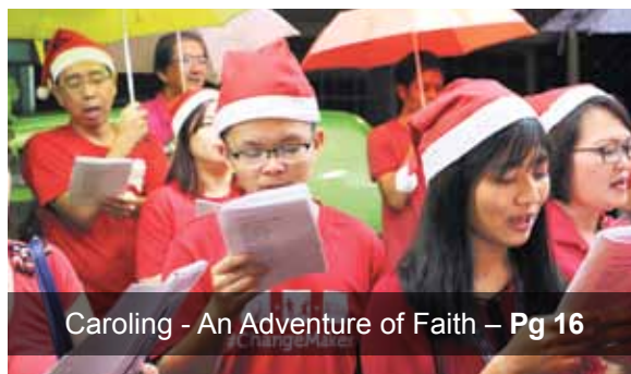
Caroling - An Adventure of Faith – Pg 16