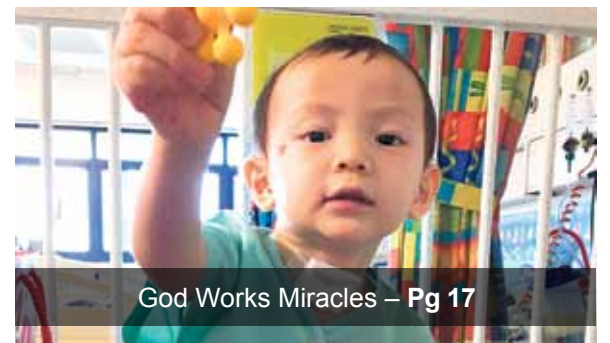
God Works Miracles – Pg 17