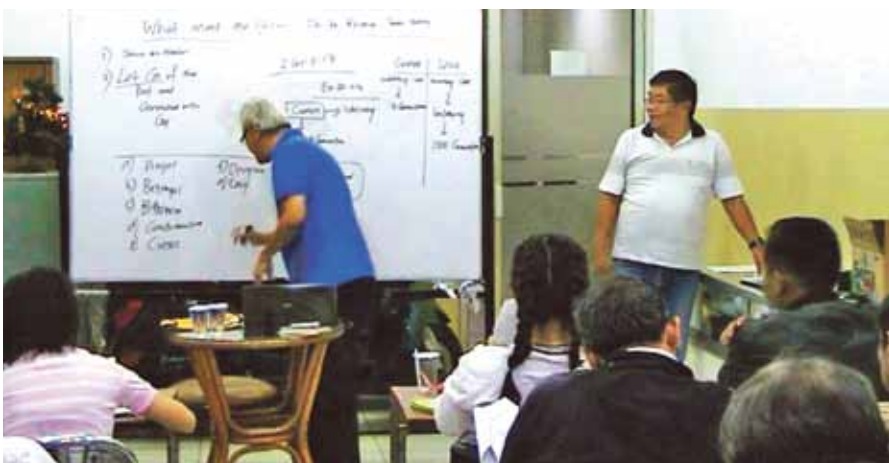
Teaching during the Inner Healing sessions

A man in one of the churches we had visited had a tumor in the prostate and it had developed into Stage four cancer. Additionally, he had flakes in the lung and that, too, developed into cancer. He came to us for prayer. When he was on the floor, God did a miracle and healed him of prostate cancer and lung cancer. We want to give God all the glory for what He has done for our brother. God is really good!