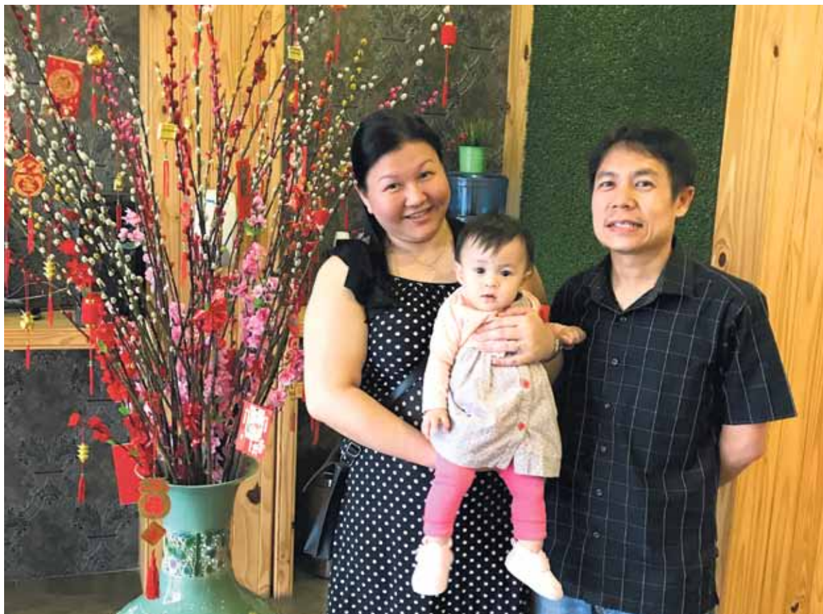
Chinese new Year celebration as a family

When she was in hospital, she was diagnosed with Chronic Lungs Disease (CLD), Retinopathy of Prematurity (ROP) and Patent Ductus Arteriosus (PDA), which were related to her early birth. In simple words, her lungs, eyes and heart were