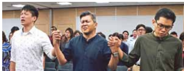
Supporting one another in our leadership journey with prayers

Acknowledging that every person has their own God-designed journey on planet earth, they exhorted us to each fulfill God's purpose in our generation. They shared openly from their wealth of experience and personal struggles, with a candid sense of humor that often sent waves of laughter across the room. Certainly, their sharing had inspired and encouraged us to persevere in our life journey and in serving God.