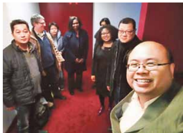
Our leadership gathering to pray for direction

As we began to communicate and share the changes involved, we asked everyone to express their sentiments as well as their concerns. We wanted to hear from everybody and raise up any issues that needed to be addressed along the way. After which, we had a time of prayer together, committing what we had discussed to the Lord.