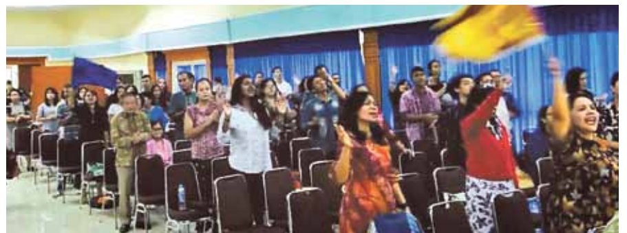
The congregation worshipping and welcoming the presence of the Lord

When they went for her check up, the doctor found that she had conceived not one baby, but twins. The doctor couldn't believe this, so he consulted another doctor. The other doctor did the check again and found that the womb indeed had two babies. What was even more amazing was that before the confirmation by the doctors, God had already spoken to her husband about them having a pair of twins. God even gave the husband the names for their babies when he sought God.