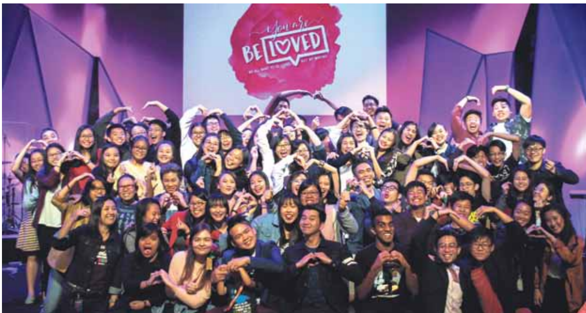
The IGNYTE ministry's leaders after the performance