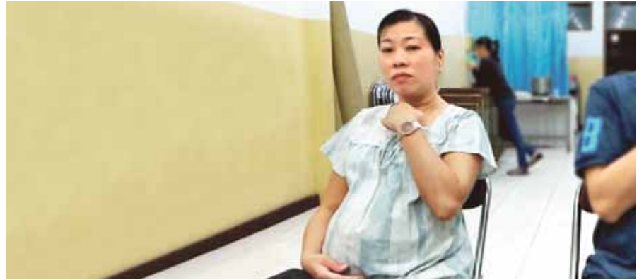
Our sister conceived a pair of twins after many years of childlessness