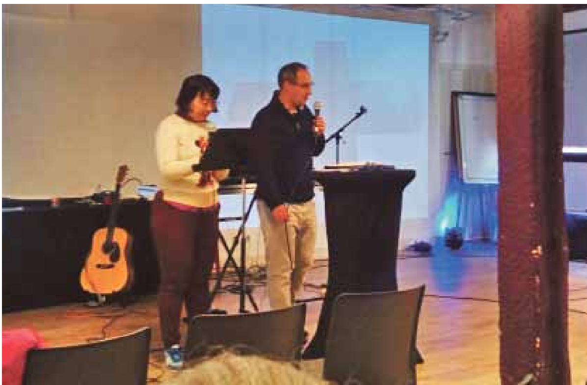
First service in English

One thing that we had asked of the Lord, was that the decision be a unified one, in which ALL in the leadership team would be in agreement with.