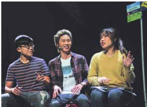
The story unfolds