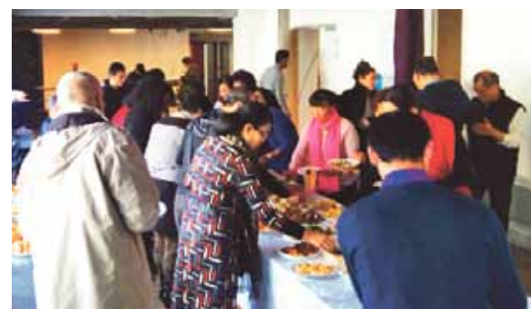
Food, fun and fellowship after our service

For more information on ElimParis, visit https://johnlimkc.wordpress.com .