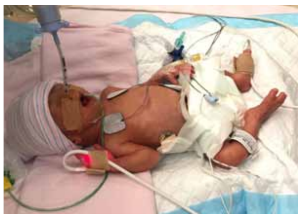
Second day after delivery

Although there were a lot of uncertainties and fear, God is good and faithful. We prayed and upheld her in God's hands because she belonged to Him. He saw her through all the obstacles in NICU and eventually, she was discharged home with a feeding tube and without major health issues. God is good, not only did He prepare us mentally, He also blessed us financially. There were many hand-me-down items for the baby, so we hardly had to spend much because Mummy was on no pay leave and had no income. The total medical bill for the four months' hospital stay chalked up to $192,000! After deducting the government subsidies, we only needed to pay $3,000 from our Medisave account and didn't need to fork out a single cent of cash! Praise God!