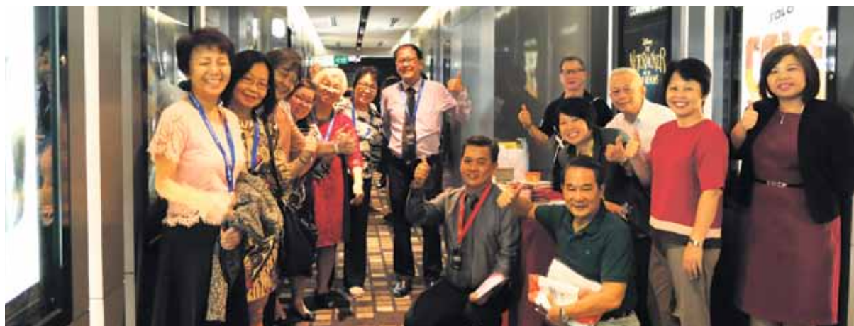
The ministry team all ready to serve

It's a joy to see a Chinese Service at Trinity@Bukit Batok because it's very close to my home. I took this opportunity to invite my pre-believing son for service and he accepted my invitation! Praise the Lord!