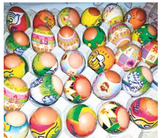
Colorful Easter eggs for the children to take home

Through this outreach program, we saw many children's lives being transformed. Many pre-believers in our class also dedicated their lives to Christ. Moving forward, we aim to inculcate godly character in our children through quality Sunday School programs like these, so that they can continue to be good testimonies for Christ to their parents. All glory to God!