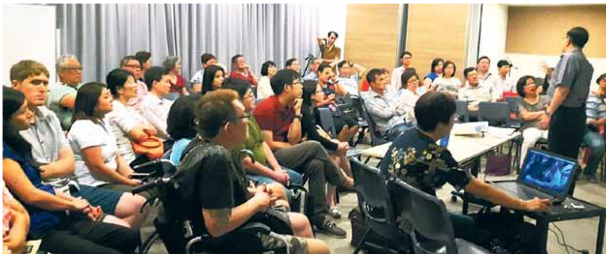
Our first Healing Room meeting at G1 on March 2017

This man is walking on his own for the first time in many years. He later came to accept Jesus as his Lord and Savior. He came into the hall escorted by many people, leaning heavily on his walking aid. To the amazement of many, he left the hall walking on his own shouting "Hallelujah!", dragging his walking aid behind him.