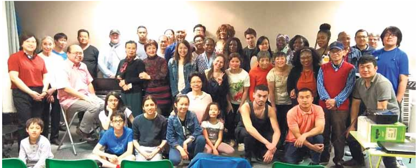
1 A group picture after our first service

In our original hall, this was not possible due to time constraints. As we followed the Lord's leading, God began to open doors for us in Paris.