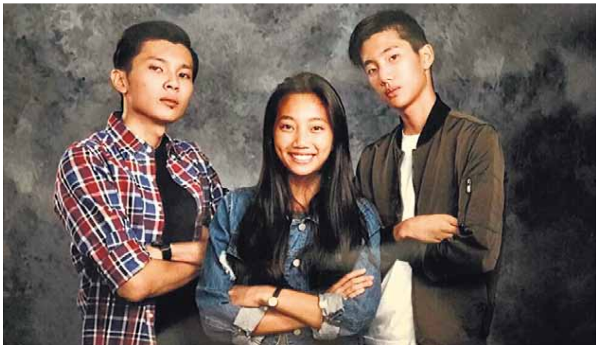
My three lovely children