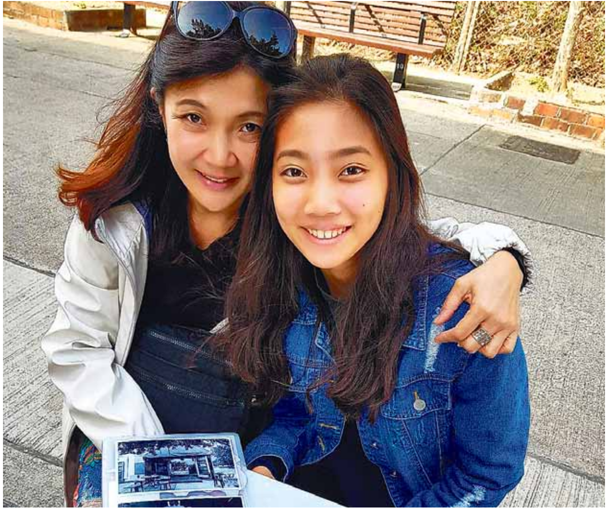
My daughter and I spending time together

Amidst the storm I went through, God has been my anchor. He not only restored hope, but gave me new meaning in life and provided overflowing blessings! I've learned to lean on and trust Him no matter the circumstance. All glory to God!