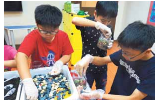
All hands on deck exploring Bible truths through Science experiments