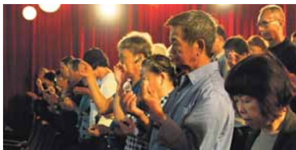
Communion was served