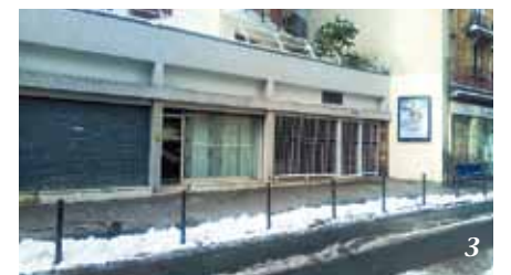
4 The main worship hall