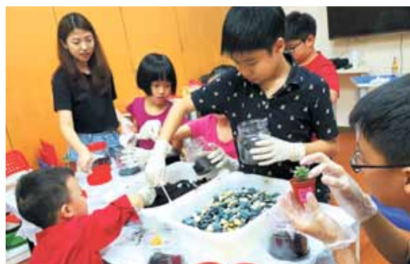
Learning from the Bible is fun

In tandem with the Easter Day message, the teachers also prepared a unique craft—creating a resurrection garden. Inspired by the idea of building a terrarium, the craft was a big hit with the children as they were immersed in adding the soil, plants and decorating their terrarium with stones. More importantly, the message that the teachers wanted to convey through this craftwork was: When a plant dies, it becomes nutrients and gives new life to other plants. This is akin to Jesus who died on the cross to give new life to us.