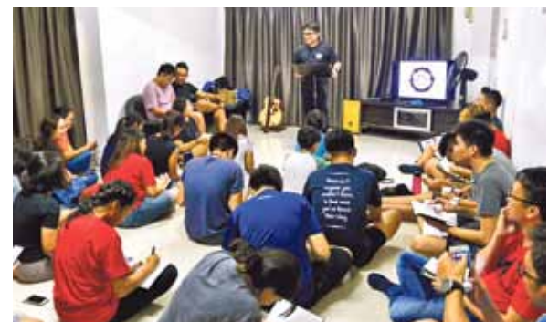
Our youths get ready for a time of empowering