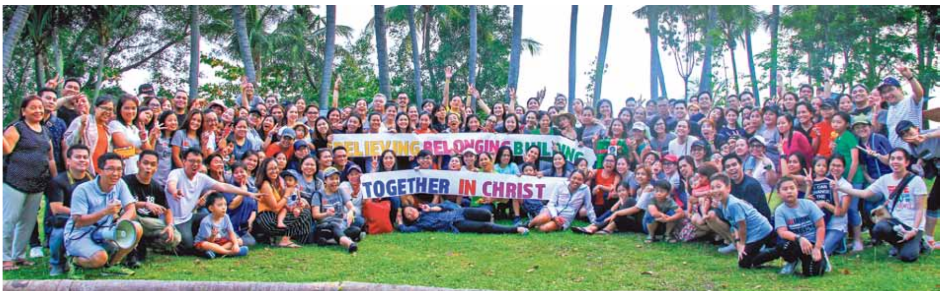
A group picture after the 2018 Family Day event