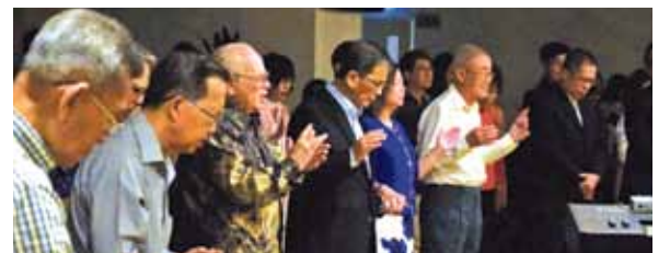
The congregation and guests going up for an altar call