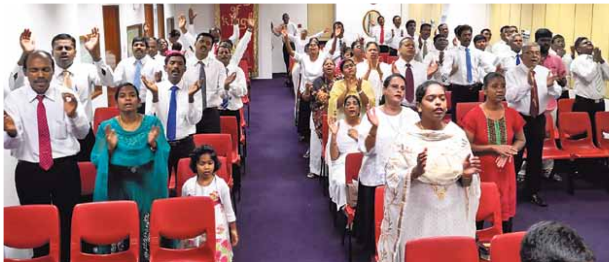
Coming together for Sunday worship service