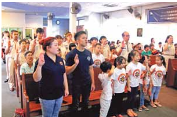
Rangers coming together for the pledge

Today, RR in ZFGC is part of a wider network to reach, teach, and keep boys and girls for Christ. It is our prayer that Outpost 21 will continue to stay relevant, and that we will gain strength and insight into where the Lord is leading us next. May our next 10 years be better than the last!