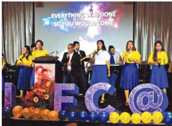
Leading our people into worship