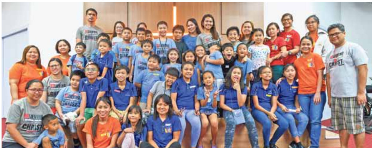
Our vibrant children's ministry