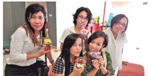
Spreading some love to our friends with our gifts