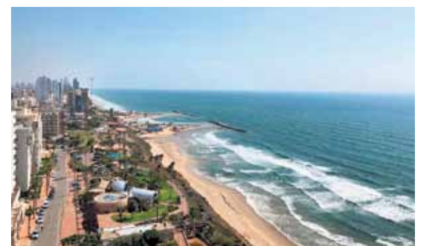
Mediterranean coast at Netanya

Overall, the trip had brought the Scriptures to life, and had left a deep impression in each of us. Moreover, it allowed us the opportunity to bless and honor the first custodians of the Scriptures, the writers of the New Testament (except one) and the first evangelists. What a privilege!