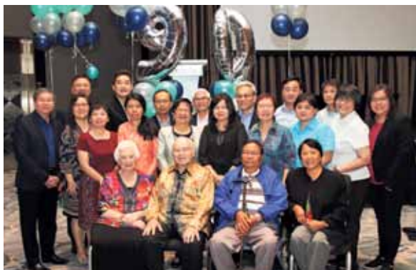
Our Senior Pastor, current staff and pastors

May the Holy Spirit be the empowerment and the Word of God be the guiding force of Elim Church as she moves to the next significant milestone of her 100 th Anniversary.