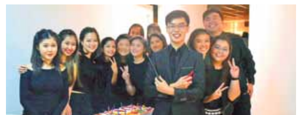
Some of our youths getting ready to cut the anniversary cake