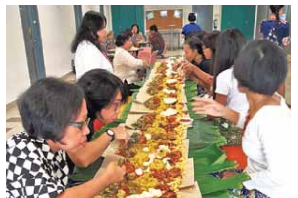
Reaching others with delicious delights