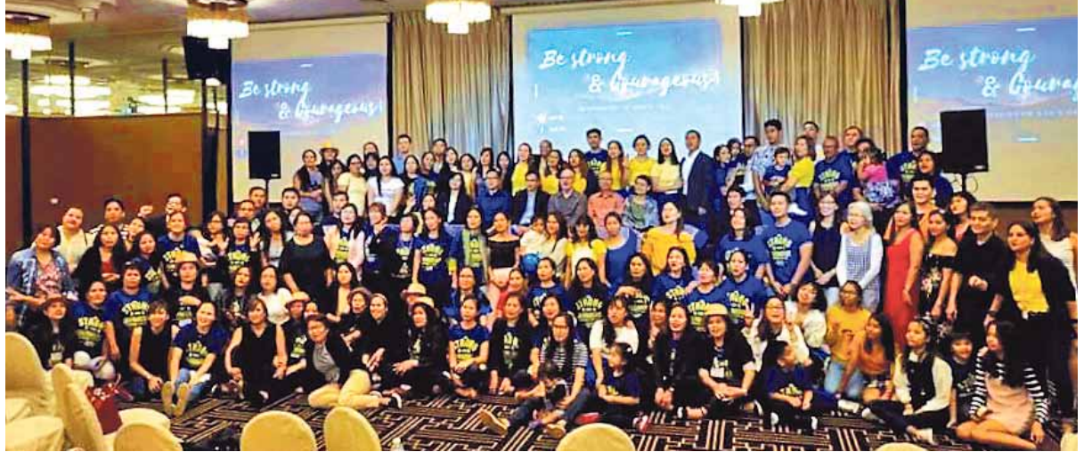
Our Filipino congregation gathering for a group photo

NDFI-FC has Worship Services at Concorde 3, Concorde Hotel, Orchard Road, at 2pm every Sunday. For more information on NDFI, visit www.ndfi-church.org .