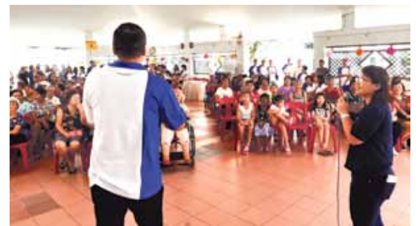
Our emcees leading in games

Indeed, we should continue to bless our community because we are Christ’s body. We are His hands and feet and His vessels of love to the people around us. We thank God for the great success of this event and pray that God will continue to do His work in the community around our church. Let us continue to serve our community and pray for God to touch His people!