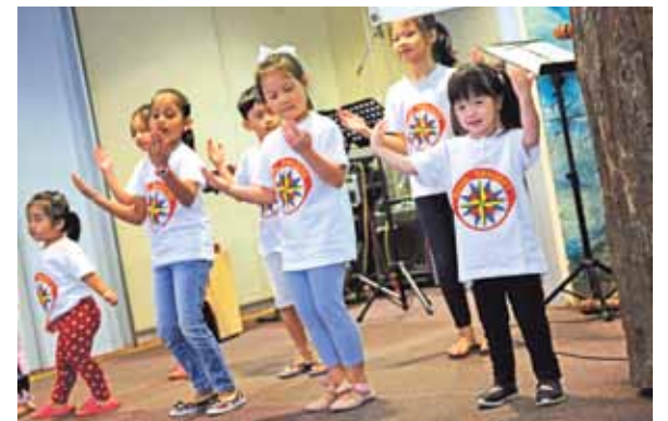
Putting great effort in their performance