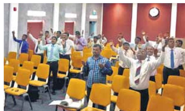
Service in Teen Challenge