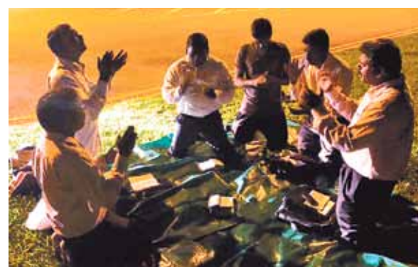
A cell group gathers to worship God and bring the light of the Gospel wherever they go