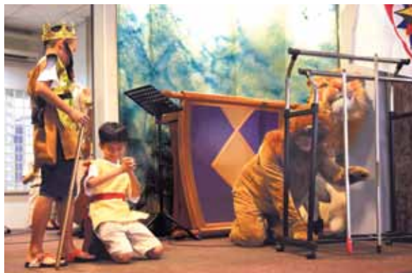
Discovery Rangers presenting a skit on Daniel and the Lions