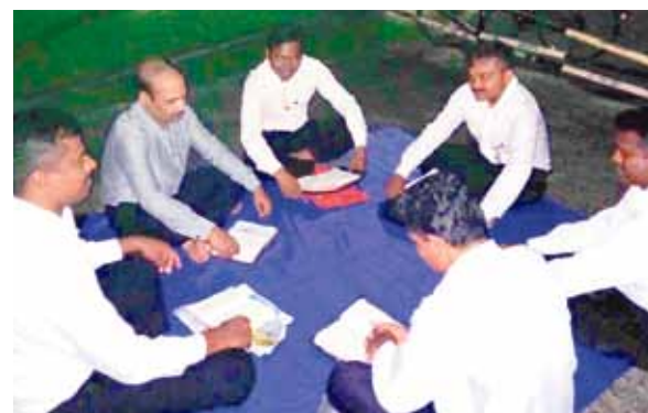
Cell groups meet regularly on Wednesdays to discuss God's Word