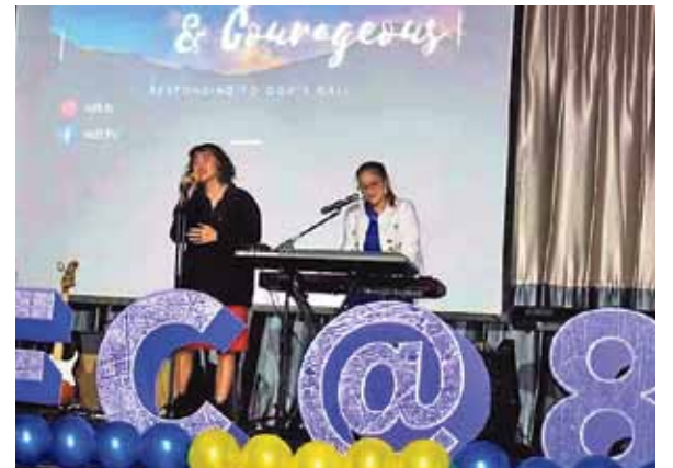
Performance by our Infinity Youth