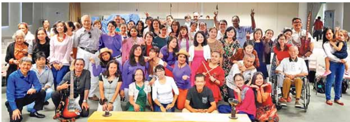
Emmanuel AG's Indonesian Ministry