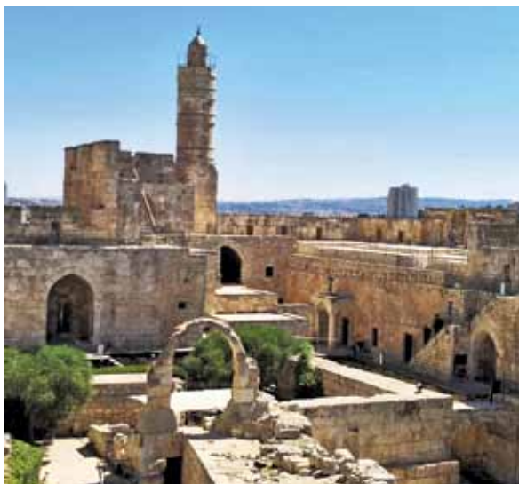
Tower of David Museum

From the coast, we traveled on to Tel Megiddo, where we viewed the Jezreel Valley. It is now a peaceful fertile plain in hues of green and brown, belying the many battles fought here. Cited on the ancient Via Maris trade route, it was the location of many famous battles. According to the Scriptures, this place will once again witness the apocalyptic battle of Armageddon. How many places on earth can one stand looking back through history and looking forward in Biblical prophecy at the same time?