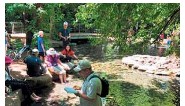
Reading the Scriptures at the Jordan River headwaters