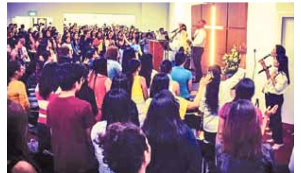
Worshipping together as a church