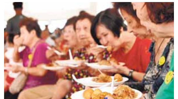
Our guests enjoying the mouth-watering food