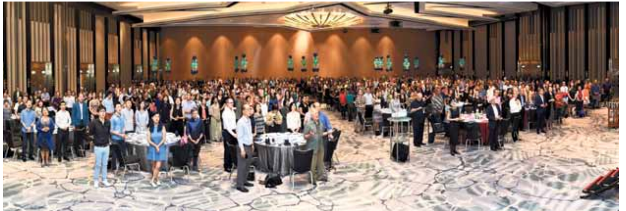
The entire church came together to celebrate our 90 th Anniversary

We give thanks to God our Heavenly Father for His faithfulness since 1928. Our pioneer members' steps of faith, sacrifices and dedication had enabled Elim to reach this milestone.