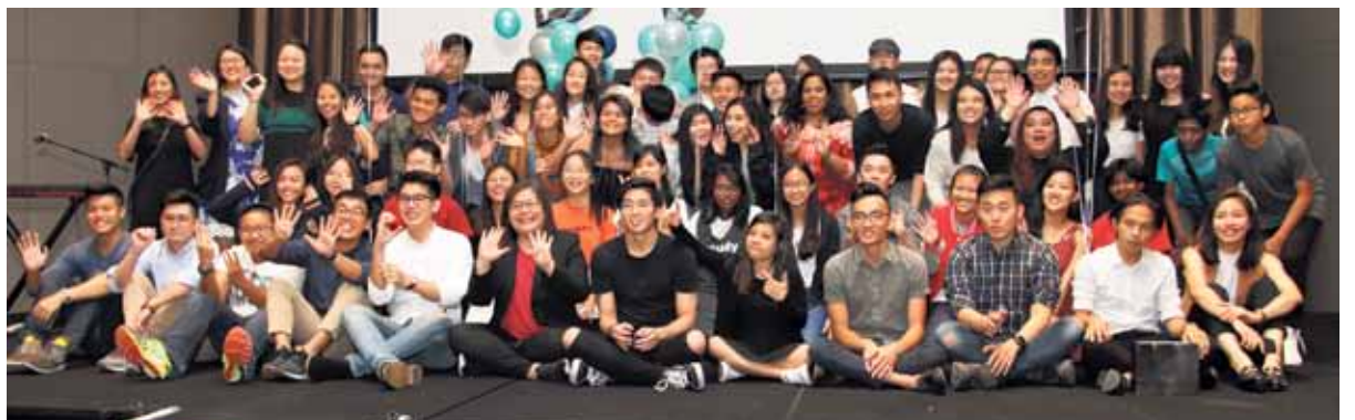
Our youths, who represent the next generation, gathered after the celebration lunch