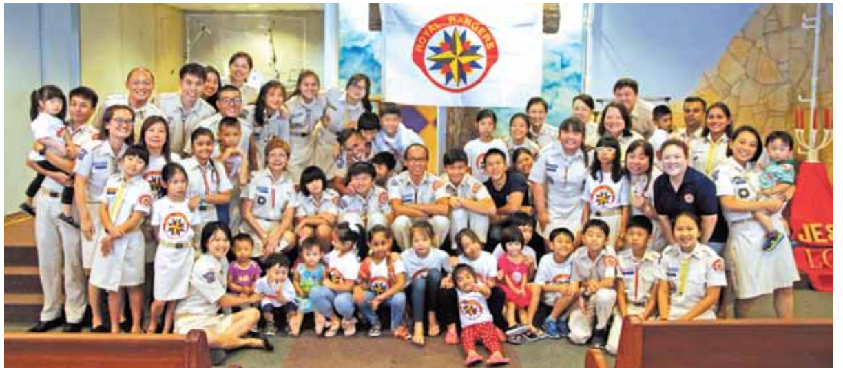
Coming together for a group picture

A heartwarming video featuring the reflections of commanders and rangers, both past and present, was also displayed. Skillfully put together by the church's newly established media ministry, the video showcased a selection of fond memories and unforgettable moments of the outpost, commanders,