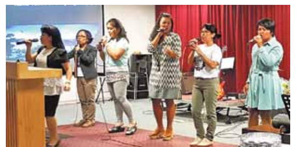
Serving together as a ministry