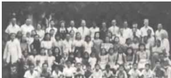
Elim Church in 1947