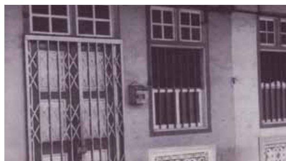
The church at 531 Serangoon Rd