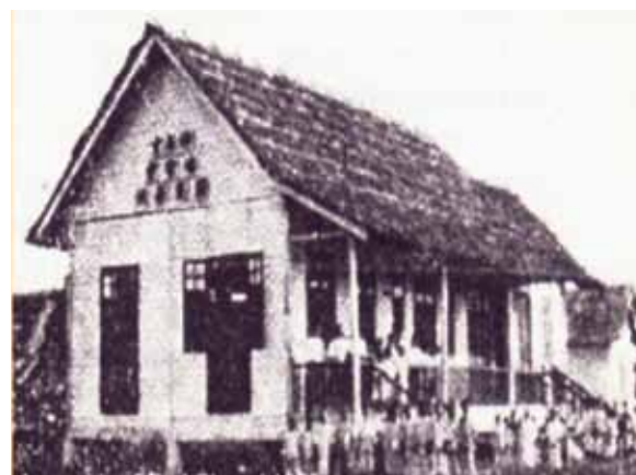
The chapel in 1928