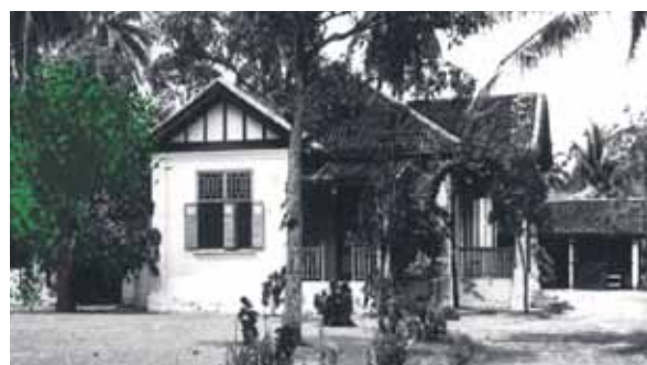
The old Elim Church at 1079 Serangoon Rd