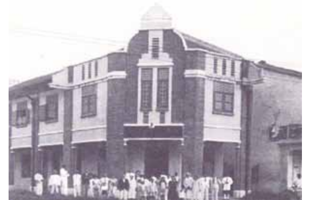
The chapel at 486 Serangoon Rd