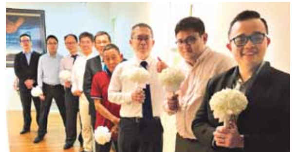
The husbands waiting for the moment to present their flowers to their wives