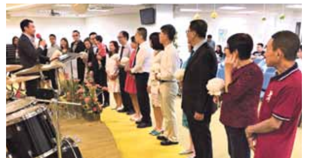
Renewal of vows