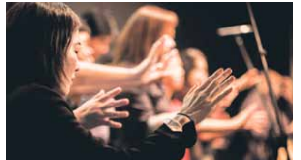
God's presence is evident in our services and meetings