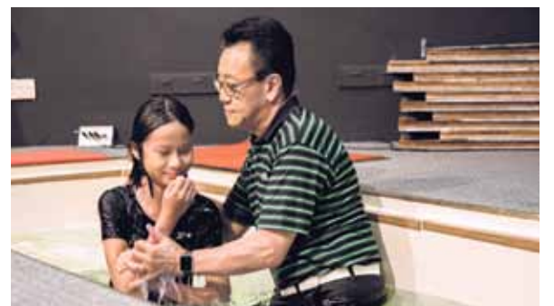
Our first water baptism service

Pray along with us at RCA! Pray that we keep true to the vision and values of our church.