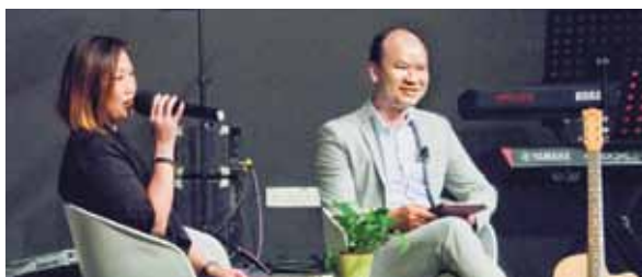
Testimonies and Tea

We've also organized a special evangelistic program called Testimonies and Tea, where Risenites shared their testimonies and afterward, a pastor preached and gave an altar call for salvation. Through that event, we saw six people come to Christ. We've had a Life Application Seminar that attracted pre-believers to come and be empowered, Carecell Christmas parties and a Christmas evangelistic service called 'The Gift of Christmas' that saw even more people come to Christ. We've also had our first Spiritual Parenting (SP) class that saw 10 students graduate from it and become spiritual parents, conducted several GROW classes to empower Risenites with the Word of God, and recently concluded a Lover's Retreat where many testified that they experienced a renewal of love in their marriages.