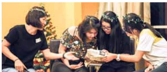
Cell Christmas party

God has been leading us every step of the way. The Lord impressed upon my heart to have daily revival prayer meetings. Without prayer, the church cannot progress as it's progressing now. For every cutting-edge ministry like a church plant, prayer is the essential key to success. In RCA, everything we do has to be birthed in prayer and bathed in prayer. It's spiritual work we are doing and prayer is the key to breakthroughs. We've been having one-hour prayer meetings daily for over 170 days now and God is visiting us in a powerful way. We're seeing prayers answered and lives of Risenites transformed. We've also called the church to fast and pray for greater breakthroughs.