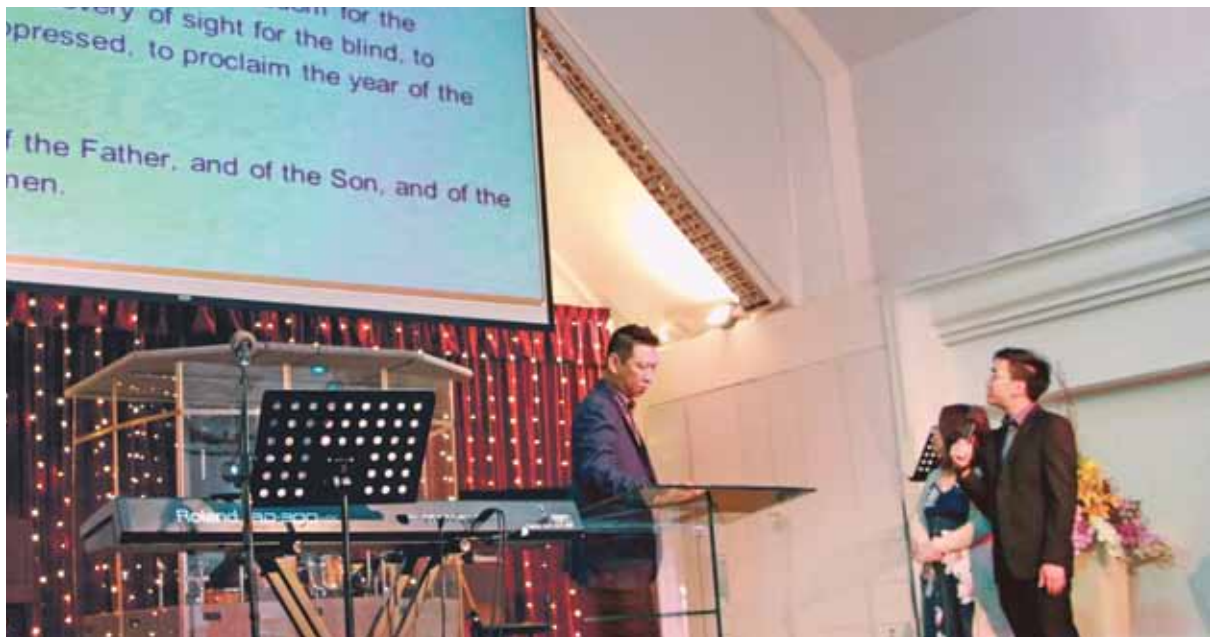
Sharing of the Word to the congregation