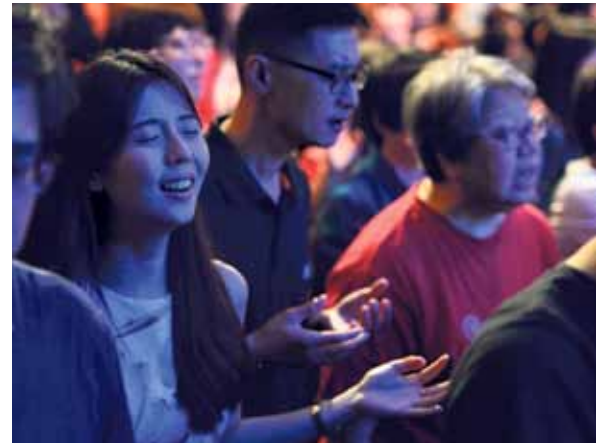
Responding to the message with open hearts