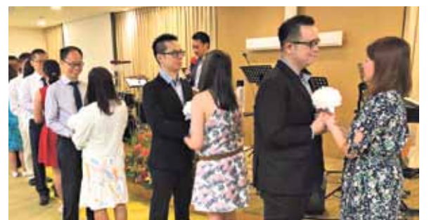
Affirming each other as husband and wife