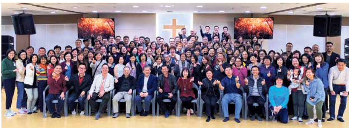
Here we are at the retreat for a time to encounter God