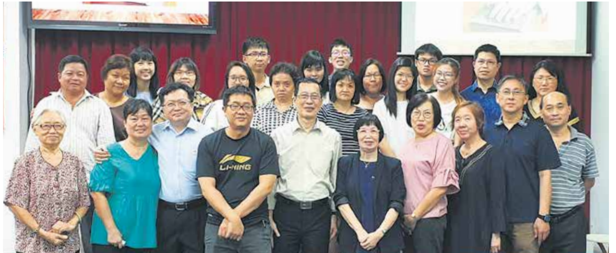
Participants sharing a group photo

Overall, through the workshop, the participants learned that