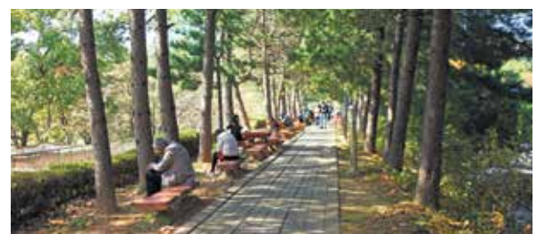
A place of tranquility to seek God