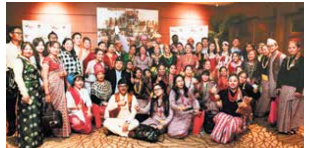
Nepali guest workers at the inaugural AGWO Banquet of Appreciation

Gathering 350 guest workers from nine different Asian countries—as well as dormitory owners, community partners and government officials—the banquet sought to thank guest workers and encouraged dialogue on how to better care for their community. This inaugural ‘Banquet of Appreciation’ also launched 24 other ‘Feasts of Appreciation’ for guest workers across Singapore, as well as an AGWO app that aims to provide guest workers with access to services and adequate assistance.