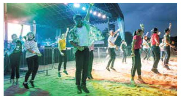
Dancing to the beat