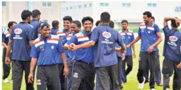
South Asian guest workers in great spirits at the AGWO Cricket Cup