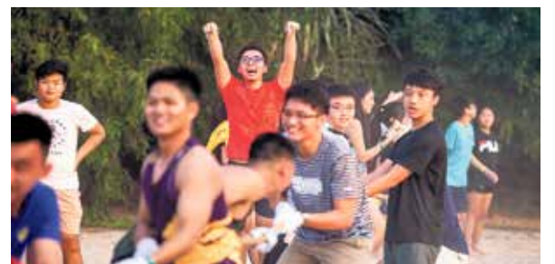
Having fun during the games