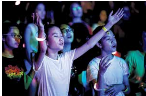
All we want is to worship the Lord