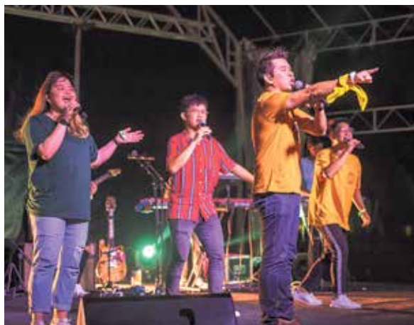
Ministering to the IGNYTErs