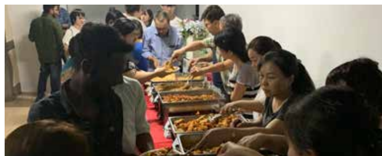
Times of our ministry to the migrant workers