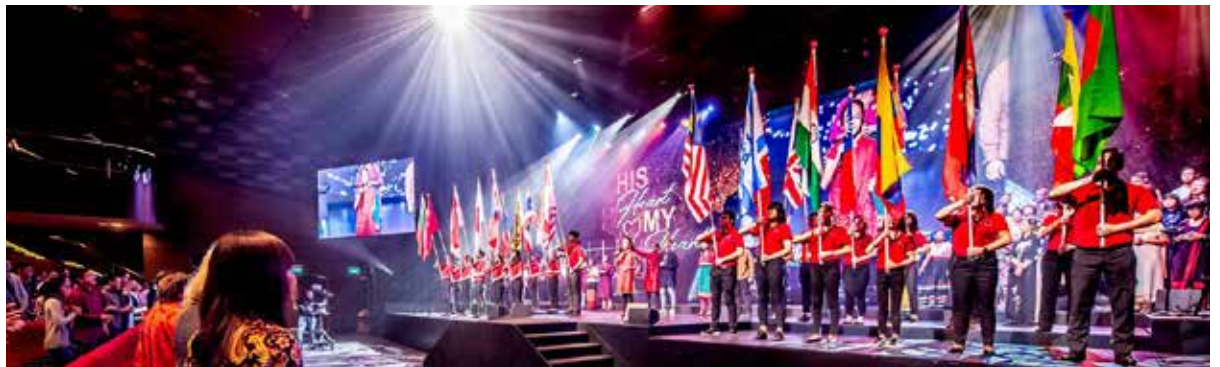
Parade of the nations