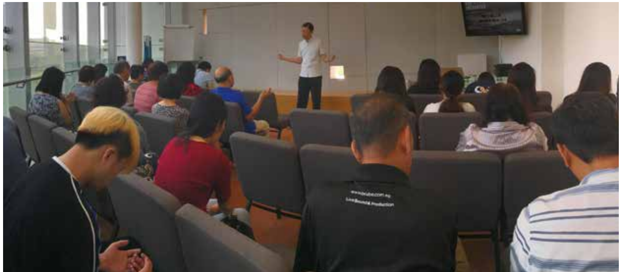
Seeking and hearing from God intently

perspectives and truths, which I would have easily missed had I not paid close attention. It stirred a renewed hunger to dive deeper into His word. Praise the Lord!”