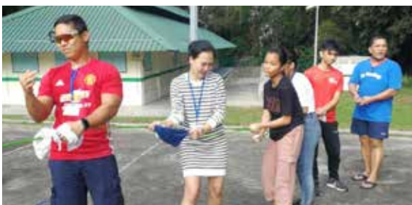
Putting our strength together during a time of games

Amidst the plethora of events that took place, campers were definitely enriched with the teachings of the Word of God as well as the fellowship of friends and family. Praise God for another successful camp and we look forward to many more things in store for NDFI-FC.