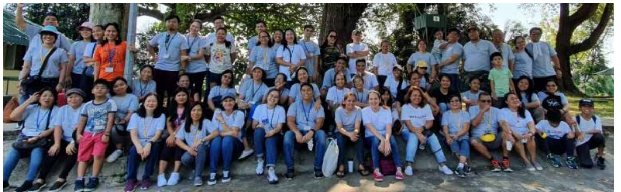
A group picture to round up the camp