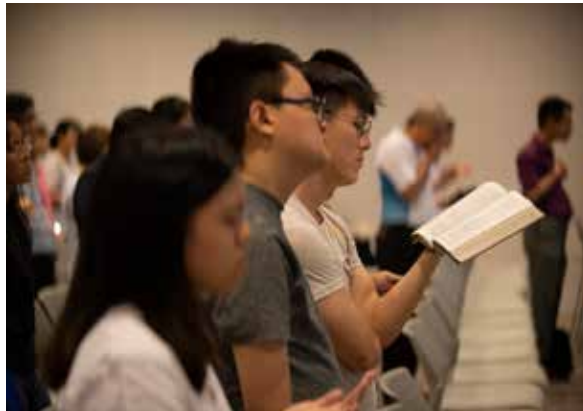
Bethelites coming together to worship God in the 40-Day God Encounter

“Through the 40 days, I gained a fresh encounter with the Gospels,” Bro Jerome shared, “It opened me up to new