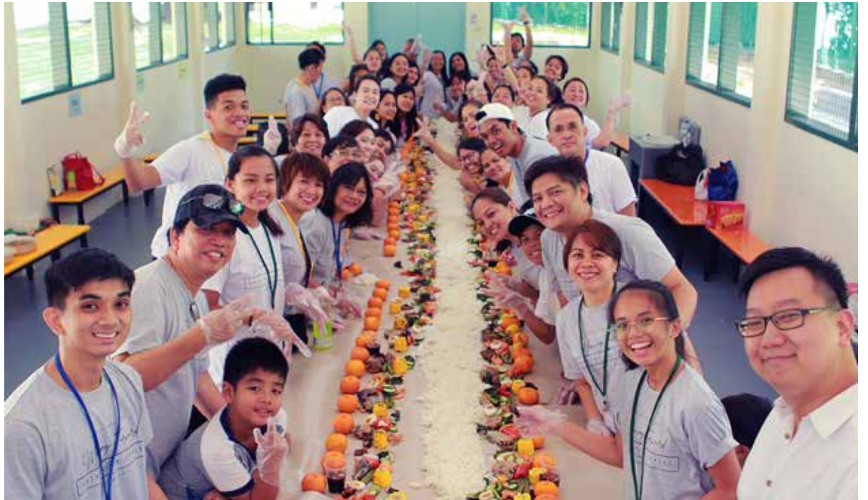
Boodle fight: enjoying a meal and fellowship