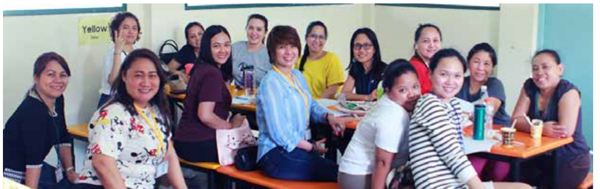
Taking a pause from our discussion about issues affecting women