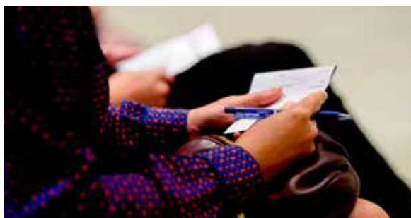
Responding to God's call to give