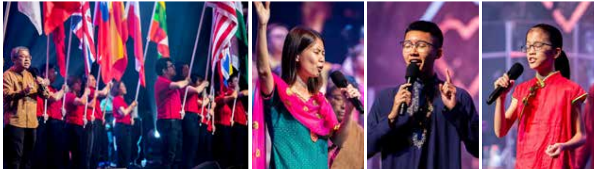
Generation interceding for God's heart to be our heart

Trinitarians were called to step out and give their very best so that the plans of heaven could be carried out through us.