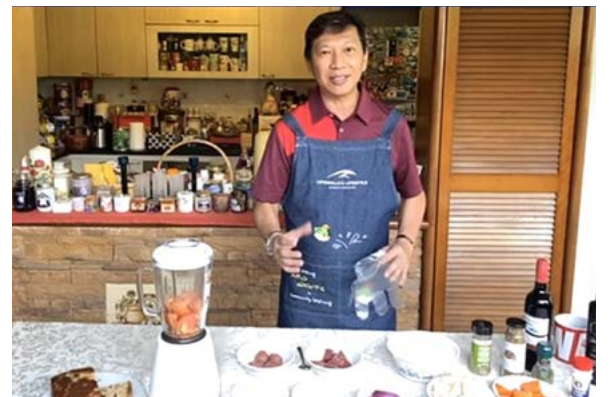
Dom can cook, so can you!