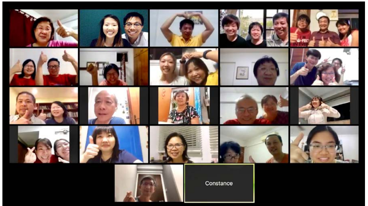
Prayer meeting online

Moriah AG's mission to bring church online did not stop there. Soon after, Moriah's Outpouring Night (OP night), where the church comes together for a prayer night, started taking place