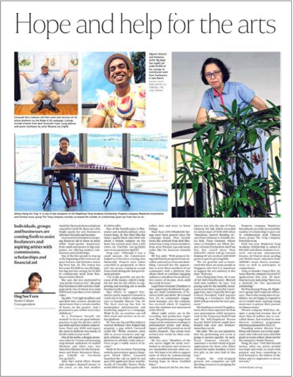
A newspaper article featuring artists who were offered help by businesses and organizations