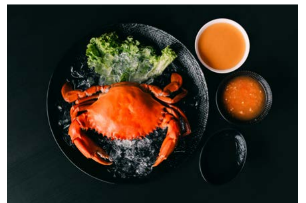
Food pictures to attract diners