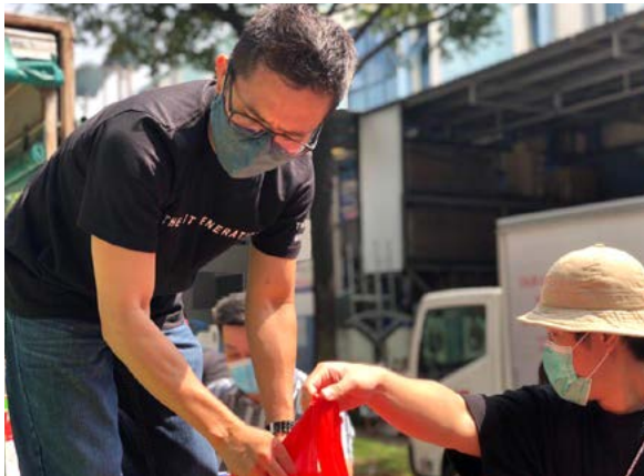
All hands on deck

These fears and uncertainties however, dissipated as we began to distribute the fresh fruits to the migrant workers. We were welcomed with warm greetings and our deliveries were received with grateful smiles. Even in the midst of what