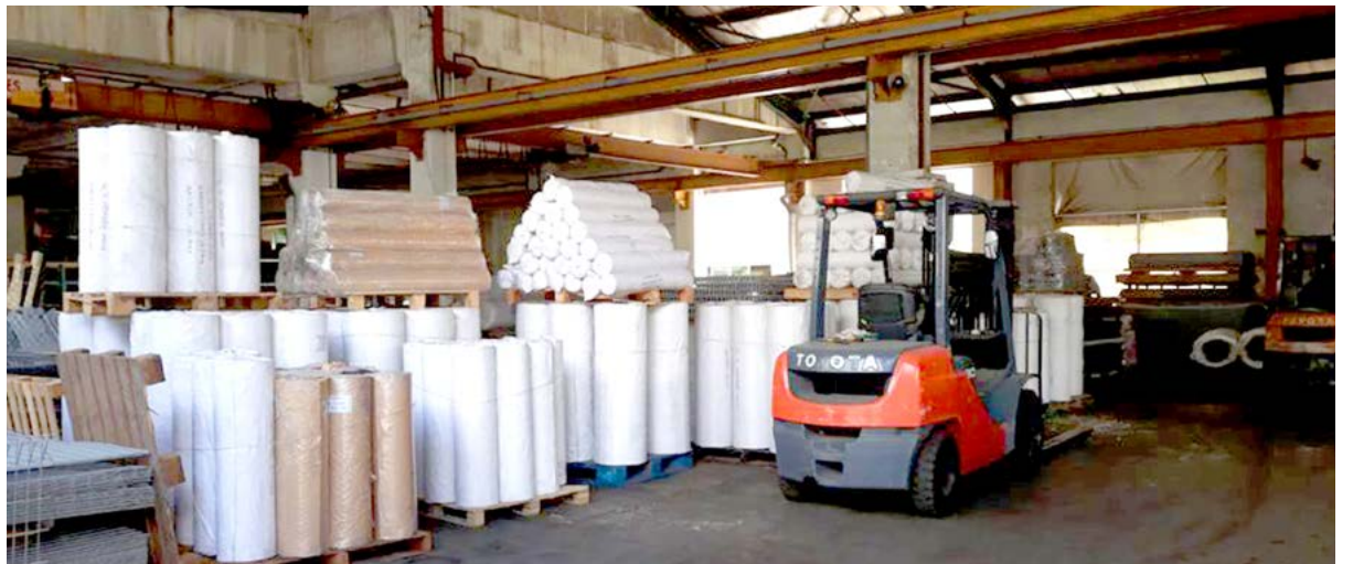
Warehouse rental and other expenses had to be paid despite zero income and increasing bad debts but God turned it around

"Instead of looking to God, I let the crisis get the better of me. But when I sought God and let Him take over as the CEO, nothing could stop His plans for my staff to experience His blessings. Not the Circuit Breaker, not COVID-19. He is indeed over all and my CEO! Praise God!"