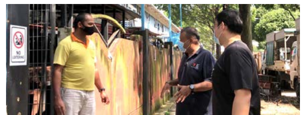
Exchanging a quick conversation

在这世界多变，疫情可怕，生命脆弱，人心惶惶之际，是身为神儿女的基督徒将上帝的平安和爱活出来的最佳时刻。就如(提前6:18)记载“又要嘱咐他们行善，在好事上富足，甘心施舍，乐意供应人”。施比受更有福，感谢主，给我们有这样的福分，藉由这次的爱心水果行为，将神的爱显明出来。