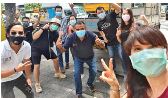
Sharing a light moment