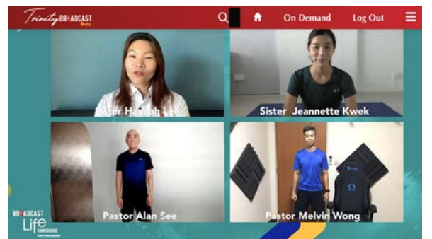
Stretching exercises that are useful while working from home in Stretch Forth