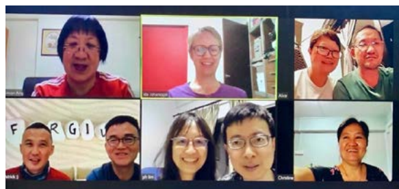
Gathering to pray, edify and encourage one another