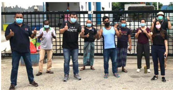
Coming together to be a blessing to the migrant workers

In a first-world country like Singapore, we sometimes forget how blessed we truly are. God calls us to love our neighbors as ourselves—not only to the people familiar to us, but to go beyond that. It was truly a great privilege to participate in this project, to be able to get a glimpse of God's heart for His people, and to be used as a vessel in showcasing and delivering His love to the migrant workers community.