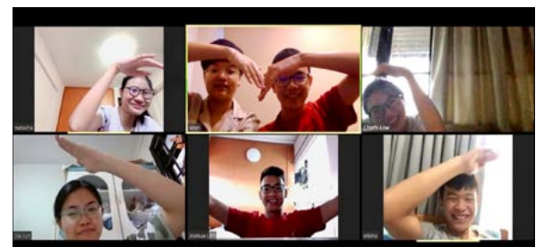
Our youth showing their energy and youthfulness with a big heart

on Zoom, where we capitalized on the platform's breakout room function to facilitate small group prayer sessions. The different cell group leaders started holding cell group meetings (or in the case of the youths, life group meetings) on whatever video chat platform available, such as Zoom and Skype.