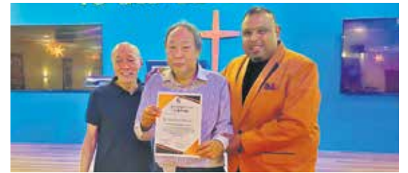
Giving out baptism certificates to our members