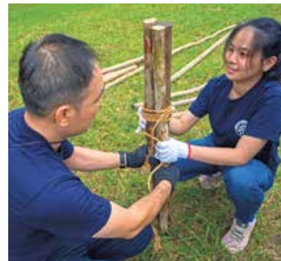
Lessons on rope craft and lashing provided trainees with knowledge to build structures necessary for a safe and comfortable campsite