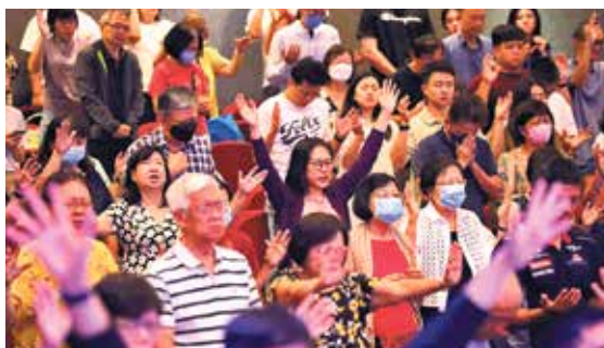
The launch of our 40 Days of Prayer Campaign

From February 12 to March 26, 2023, the campaign saw old and young alike dutifully meditating on a verse in Scripture daily, and actively taking notes during the sermon series on Sunday. Sermon topics from the campaign included “The Five Dimensions of Prayer”, “Praying for Healing and Restoration”, and “When God Says No”, amidst many others.