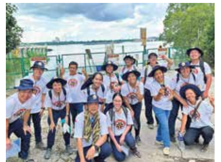
The trainees embarked on a hike to explore the many interesting places of interest around the Northwest region of Singapore – Wetland marshes, frog farms, abandoned prawn farming sites