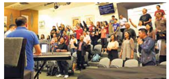
Gathering for Good Morning Jesus prayer initiative where families could come together to seek God first in the morning

Another prayer initiative, Good Morning Jesus, was held from 7am - 8.30am in the morning during the March school holidays, with the hope that families could come together to seek God first thing in the morning.