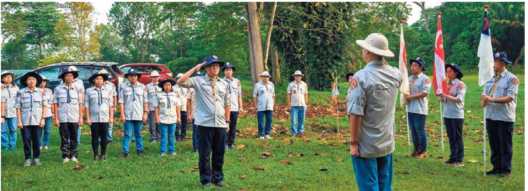
Trainees formed up for a morning parade to hear a morning devotion from the camp chaplain and a word of encouragement from the camp commander

It was an amazing experience to join other trainees as young as 19 years old who have grown up in the RR program at NTC. Their ability to lead others and serving God was a testament to the value of the RR ministry. I hope my own three children will get to grow up to be like them and become future leaders who will serve God faithfully.