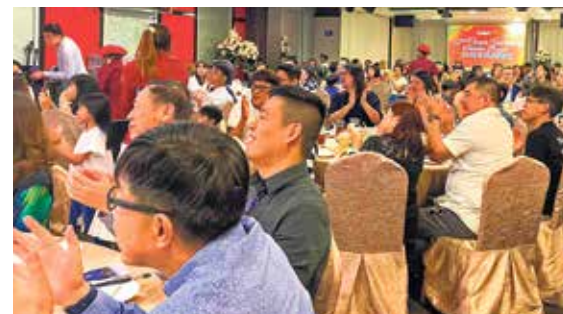
Gathering as a family to rejoice together