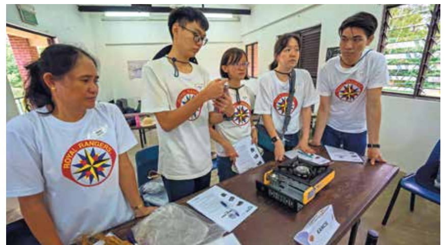
Almost all meals were cooked by the trainees in the outdoors where trainees learned to handle food and cook safely with a portable gas stove, open fire and charcoal fire