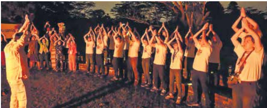
Evening campfires brought fun, fellowship and an opportunity for the trainees to dedicate and commit themselves to serve God in the RR ministry