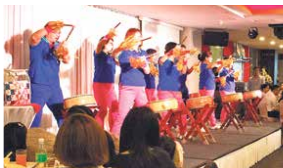
Praise Drums performance

As the items were auctioned off, the winners were announced. The auctioneer thanked the participants and highlighted the success of the event, revealing the impressive amount of money raised for our community services.