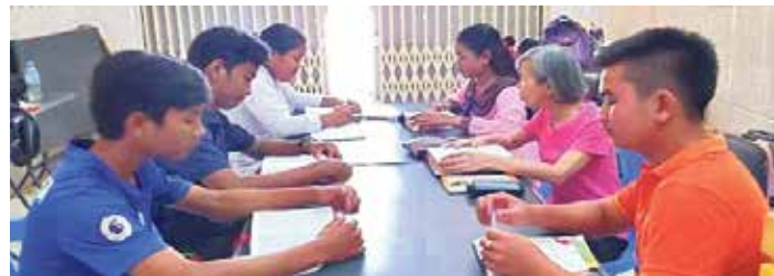
Imparting the Word at a leaders meeting

This incident motivated me to be willing to face whatever challenges that might come my way, to reach people with God's love.