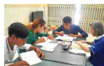
Teaching in a cell group