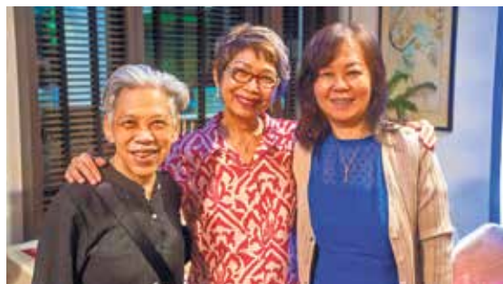
Faithful members celebrating and serving in unity

Truly, God deserves the highest glory. Amen!