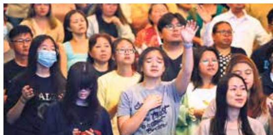
Coming together during our Pre-Service Prayer to usher in the presence of God

Pre-Service Prayer was held 15 minutes before Sunday service started. This was meant to prepare ELites for the service, and also to foster a culture of prayerfulness.