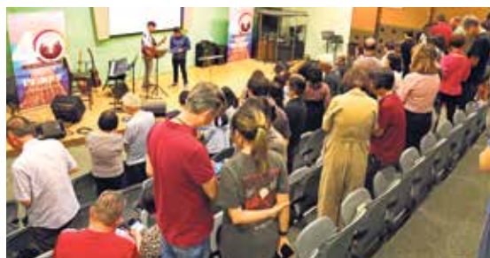
Members praying for one another during P.E.N.

The second initiative, Prayer Encounter Night (P.E.N.), was held on Tuesdays at 8pm. Throughout the four sessions, ELites learned how to pray, and practiced praying for one another using different Scripture verses.