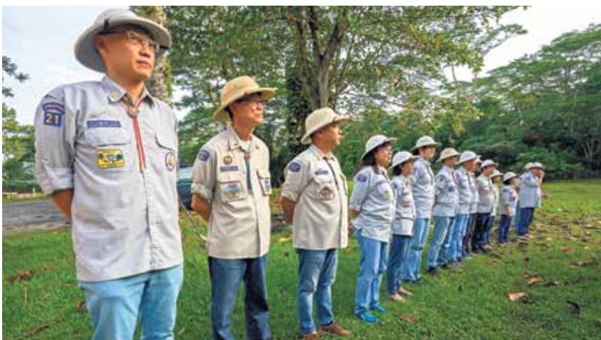
The training staff and instructors, who are volunteers serving with dedication and excellence, played a pivotal role in crafting the learning experience and smooth running of the camp