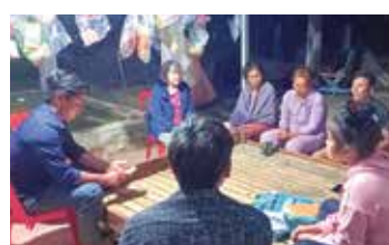
Ministry in a cell group