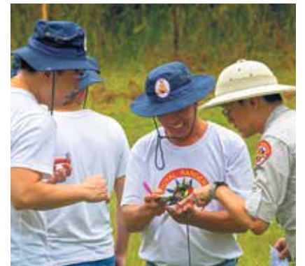
Trainees were taught to navigate and lead a hike where they used a basic compass and map as well as GPS and digital maps