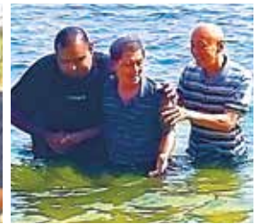
Coming out of water into a new faith