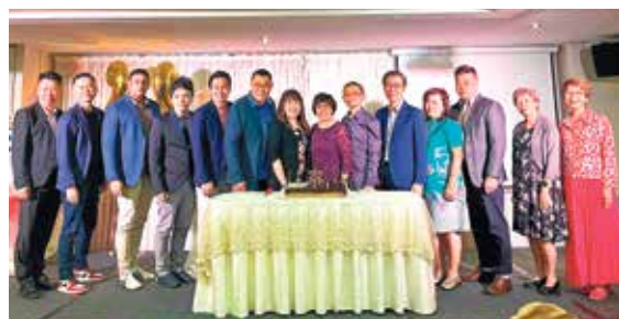
Church Board and Pastoral Team

As the guests enjoyed the delicious food, the banquet hall was filled with the sounds of laughter, joy and heartfelt conversation as we enjoyed one another's company on this joyous occasion.