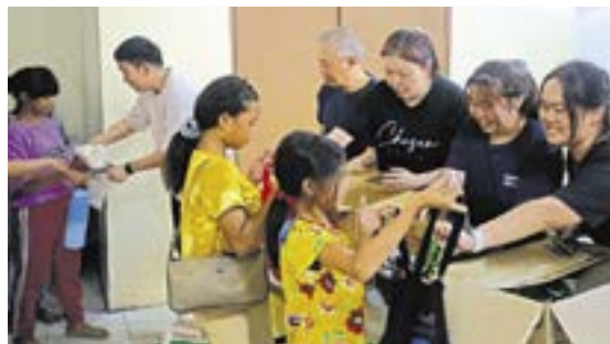
Food distribution at the Fellowship Meetings

with confidence and to overcome it. We have power and authority in Jesus' name!"