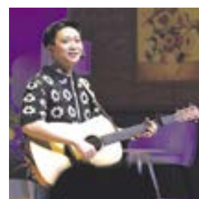
A captivating theme song ministering to the audience

extended invitations to the audience. We also give thanks for the many more who were touched in ways we may not even be aware of.