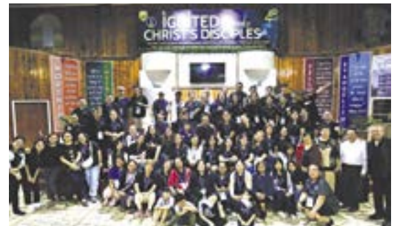
Renewed in spirit, strengthened in bond, and ignited with purpose to serve