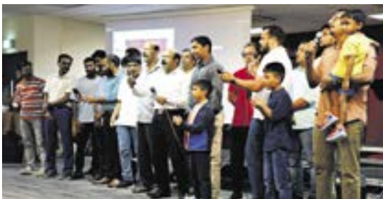
A worship song by our brothers

The celebration commenced at 10am with a powerful session of prayer and worship. The sanctuary was filled with voices lifted high, as the congregation sang hymns and songs of adoration, creating an atmosphere of reverence and gratitude. As we worshiped, we were reminded of Psalm 95:1, "Come, let us sing for joy to the Lord; let us shout aloud to the Rock of our salvation."