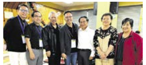
Together with our guest speakers and their spouses