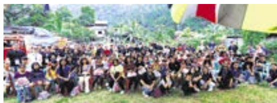
Our retreat journey culminates in service to the community of Nangalisan Tuba, Benguet, Philippines

The Living Word Fellowship Church Retreat was a truly meaningful experience. REFRESHED in God’s presence, RECONNECTED as a body of Christ, and REFIRED with a renewed passion to serve Him!