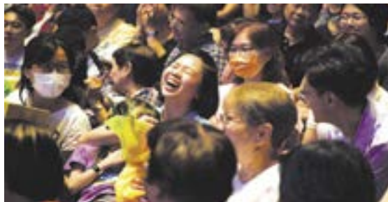
Laughter and fun in the house

glimmers of hope in their own challenges and realise that, like the characters, they too can find their way through life's shifting seasons.