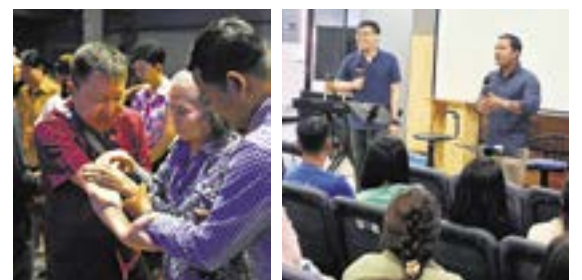
Teaching pastoral staff and ministry teams in Cambodia