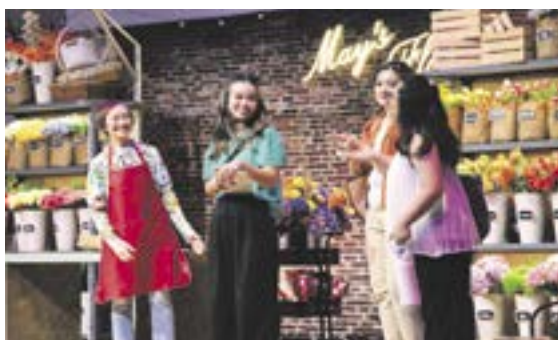
Our actors gave their very best