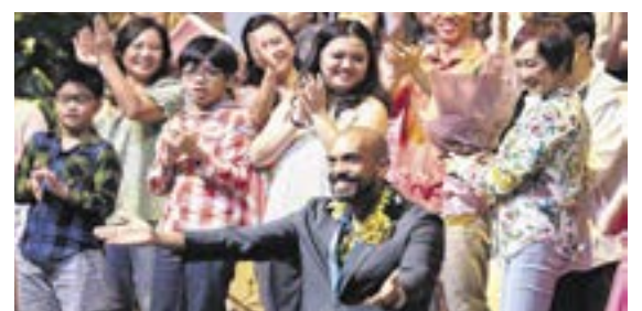
Team work makes the dream work

As the lights dimmed and the final notes faded, many in the audience left the auditorium carrying not just memories, but a renewed sense of hope. Though they had come for the show, we believe many departed with a divine touch. We thank God for the opportunity to plant seeds of faith through this EL Drama!