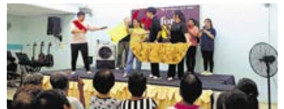
Skit about Peter walking on water

The ZFGC mission team has been so blessed by the Filipinos' love for God. Many of them might not have much materially, but knowing God was their everything. With the numerous testimonies and thanksgiving to share, God's hand was truly upon the team and OHH!