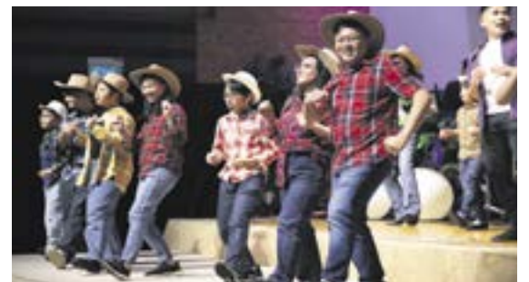
A dance of joy