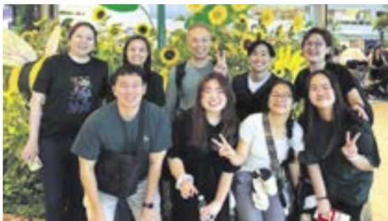
The intergenerational team at Changi Airport ready to depart

Zion Full Gospel Church (ZFGC) team of nine members had the privilege to partner with Oikos Helping Hand (OHH) to serve in Manila, Philippines from August 30–September 4, 2024. It was a journey of faith for the intergenerational team, since it was the first time for most of them in the Philippines. And for some it was even their first mission trip!