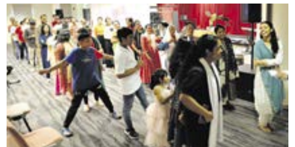
Members enjoying a fun-filled game session

As we look back on this day, we are reminded of 1 Thessalonians 5:18, "Give thanks in all circumstances; for this is God's will for you in Christ Jesus." The 10 th Anniversary of Emmanuel Assembly of God Malayalam Fellowship was not just a milestone but a reaffirmation of our commitment to continue growing in faith, serving the Lord, and spreading His love to all. May God continue to guide and bless this fellowship in the years to come.