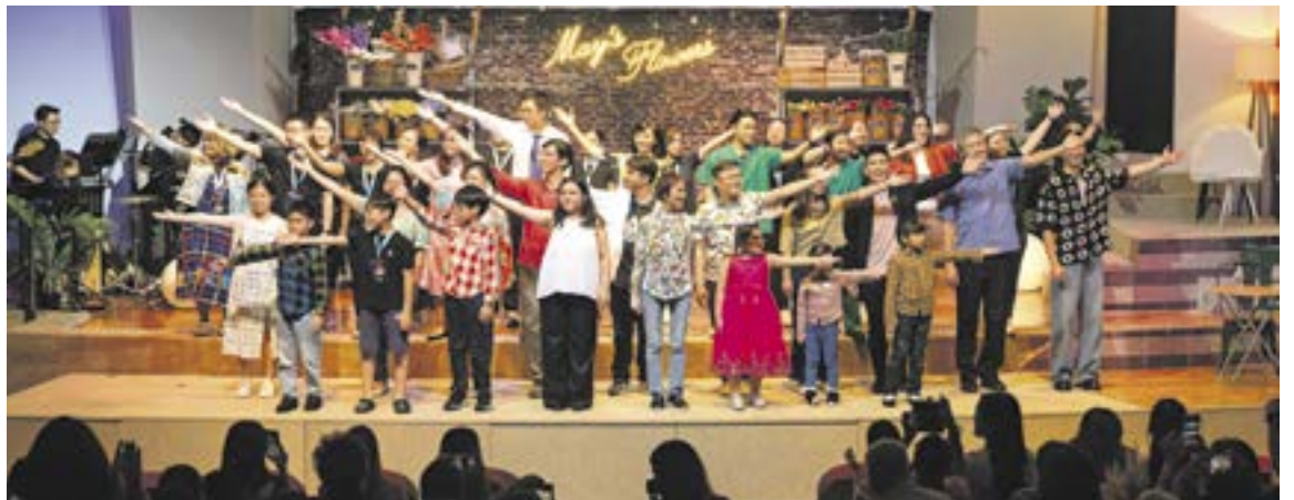
All glory to God for a successful show