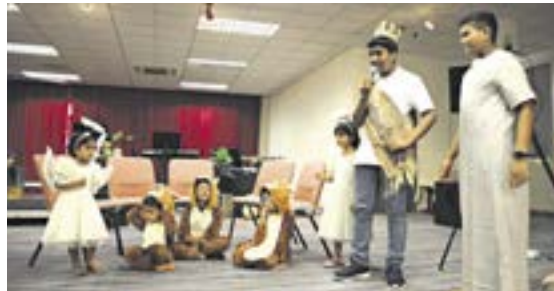
Star Kids performing a skit on Daniel's escape from the lion's den

The melodious voices of our church members, who offered songs of praise and worship, added to the spiritual ambience. Their heartfelt renditions uplifted everyone's spirit, creating an atmosphere of divine connection through music, as encouraged in Psalm 100:2: "Worship the Lord with gladness; come before him with joyful songs."