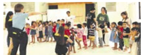
Songs, games and craft with the children

Due to the typhoon and floods, children ministry plans at OHH Learning Centre needed to be adjusted. Praise God that about 30 out of the 50 children could still attend the program! There were songs, games, a skit and some crafts to engage the four to six year-olds audience. The skit illustrates the story of Peter walking on water (Matthew 14). From the skit, the children were taught to trust in God and that they can overcome tough situations with Jesus.