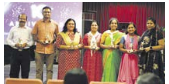
Honoring the teachers of Star Kids Sunday Bible Class

The celebration concluded with a special ceremony, during which prizes were distributed to the children, and teachers were honored with mementos for their dedication and service to the church. This was a fitting end to a day that celebrated not just the past 10 years but also looked forward to the future with hope and faith.