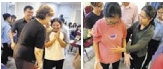
Coaching Bible school students to pray for the sick in Vietnam

Here are some encouraging testimonies from the pastors and ministry leaders of the Singapore churches we ministered in.