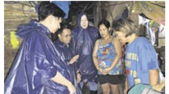
Home visits at the slums

"During our home visits in the Philippines, we had just 10-15 minutes to connect with each family, but I learned how powerful even brief moments of love can be. By embracing every opportunity, I can be a willing vessel for God's love to flow through, even in short interactions."