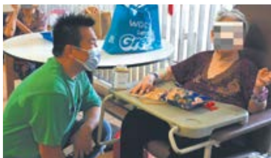
Touching the lives of the elderly through community work

Now that I've experienced the power of redemption firsthand, I want to inspire others by showing them that true freedom is possible. My mission in life is to help others find the same second chance that I was given.