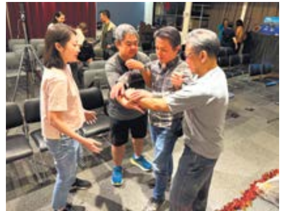
Coaching the ministry team @ Soakability, Singapore. This church is known for their healing and prophetic ministry. I am privileged to be invited to coach their team to be more effective in praying for the sick.