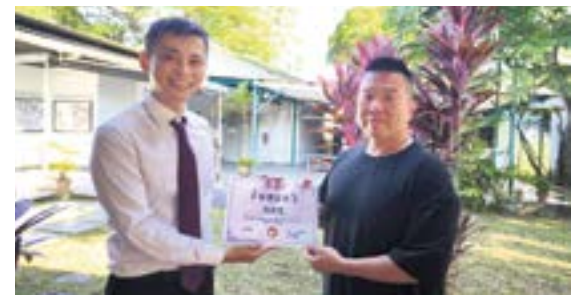
Taking a step of faith in water baptism to testify being a newly transformed follower of Christ

Aside from serving at Teen Challenge (Singapore) as a general worker in moving services and maintenance, I attend Shalom Baptist Church regularly. I recently completed the New Life courses for new believers. On December 25, 2024, I had the privilege of being water-baptized.