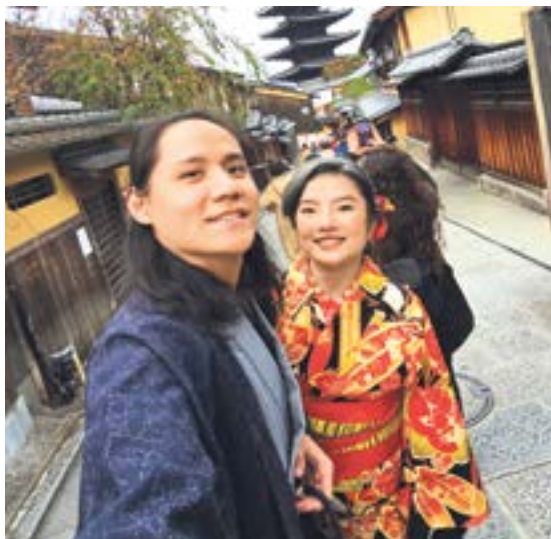
With God on our side, we journey together in strength

An overwhelming sense of relief and victory filled my heart because of what God had done. My faith was strengthened like never before. I now know, without a doubt, that God is real, and He is an all-powerful, prayer-answering God. He is my healer and my comforter.