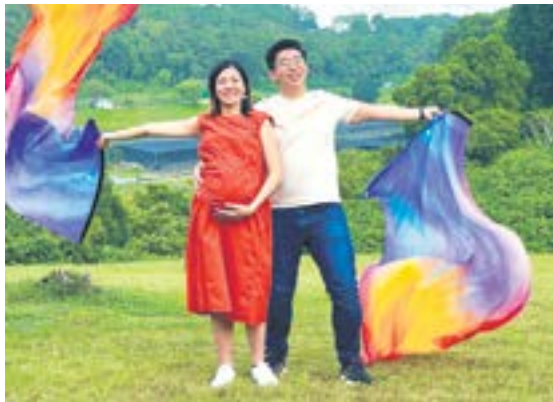
Celebrating God's goodness with wholehearted worship

"You bring life to the barren places, Light to the darkest spaces, God, it's Your nature."