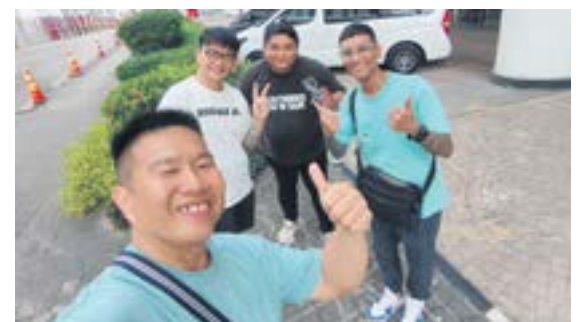
Through God's transformation and support from Teen Challenge, days ahead are marked with victory

My journey is far from over, but I now walk it with hope, faith, and a renewed purpose.