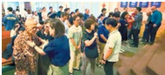
Healing service in Zion Full Gospel Church, Singapore. Earlier this year, I conducted a seminar for the church and ministered at healing services where we saw 1 st time visitors being healed miraculously by the Lord.