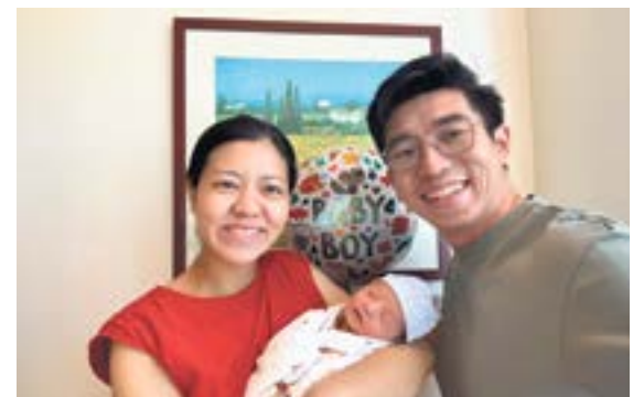
Hearts full as we receive our miracle baby

"For the Lord has chosen Zion; He has desired it for His dwelling place." (Psalm 132:13)