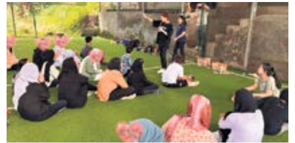
Conducting a Character-Building session