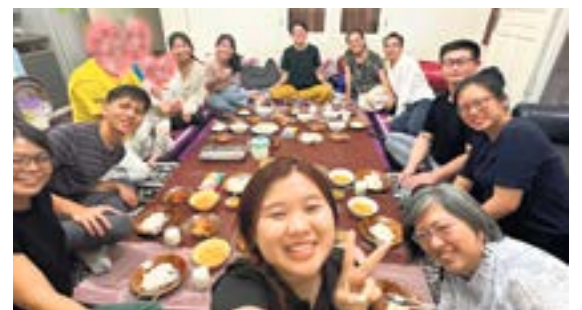
Having "Lim-Teh" time to connect deeper with the families

Have we been too busy to stop and care for those in need? Have we been empowering others to sow seeds of faith through our lives?