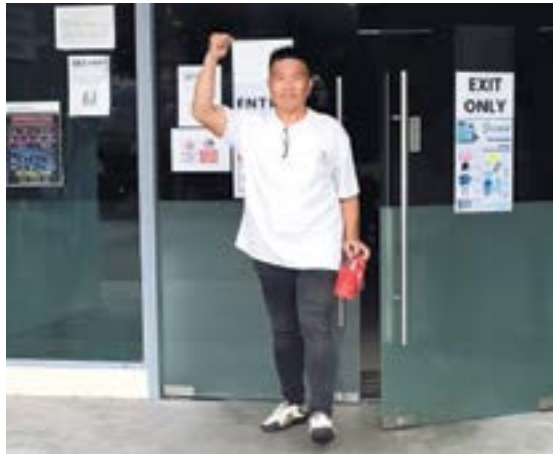
Walking free after serving a five-year sentence

The moment I heard the news, I was so overwhelmed with a mix of emotion. I was filled with disbelief coupled with an overwhelming relief. The weight of the impending death lifted off my shoulders. The suffocating fear and hopelessness that had gripped me for 26 months has