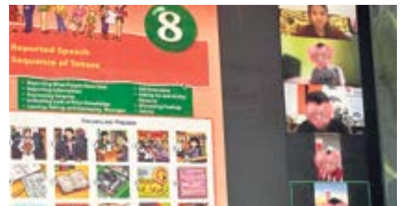
Teaching English via ZOOM to the community