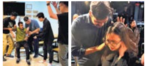
Coaching pastors and ministers at Asia Pacific Theological Seminary, Philippines. I was invited to be the practicum instructor of the 'Holy Spirit in Ministry' class. I coached the participants in the skillset needed to pray of the sick, and they ministered together with me at a healing service. The lady in the photo was certified 100% deaf in her right ear. A miracle happened at the healing service, and now she hears perfectly!