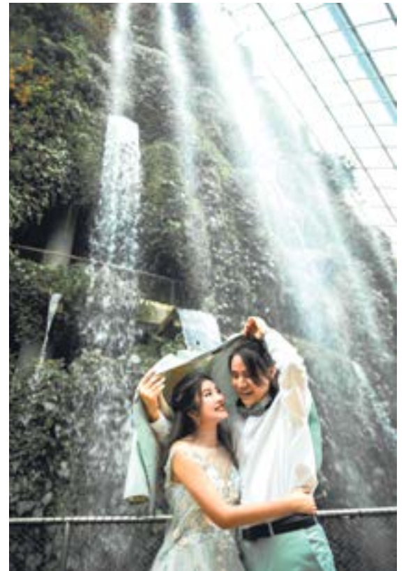
We weather through all storms knowing that God will see us through